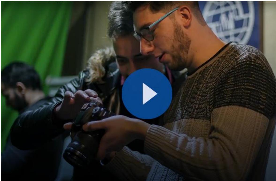
Solidarity Through Photography

HIGHLIGHTS | NEWS | PHOTO OF THE MONTH | STORIES | PRESS