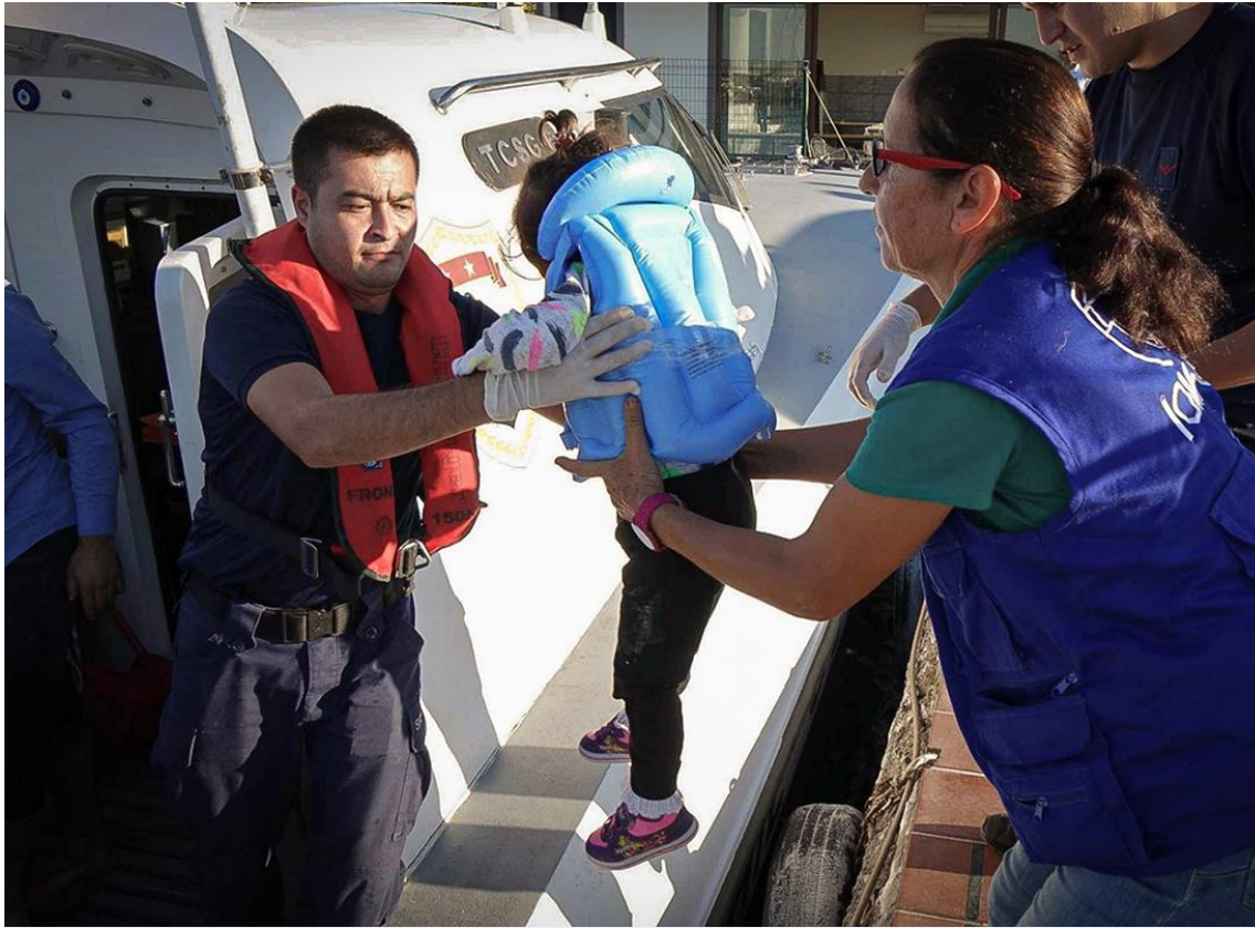
A member of IOM's mobile teams helping disembark migrants rescued at the sea by Turkish Coast Guard.