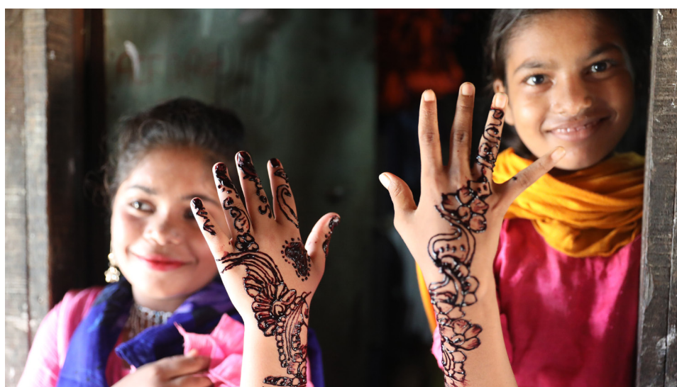
Henna design for adolescent girls is one of IOM's MHPSS activities in Bangladesh.

In 2019, to ensure an effective response, IOM was engaged in various coordination mechanisms, including co-leading the IASC MHPSS Working Group in Cox's Bazar, leading its Emergency Preparedness and Response Plan and Assessment and Research subgroups, and contributing to the National MHPSS Task Force in Dhaka.