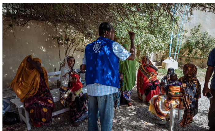
IOM staff members provide counselling to a group of Ethiopian migrant women and mothers in Hargeisa, Somaliland.

A critical gap in service availability to prevent and manage the health consequences of GBV have been identified in camps established for internally displaced persons. Fragmented service coverage and weak referral networks prevent timely access to life-saving care. In response, the Migration Health Division of IOM Somalia led the implementation of a capacity-building approach engaging a diverse group of stakeholders in immigration, justice and law enforcement, social welfare, health, and humanitarian assistance to improve the accessibility of survivors to life-saving health services. IOM trained a total of 48 male and female nurses, doctors and midwives, supporting 14 government primary health-care centres and three regional hospitals across Somaliland and Puntland, expanding existing SRH care services to include the