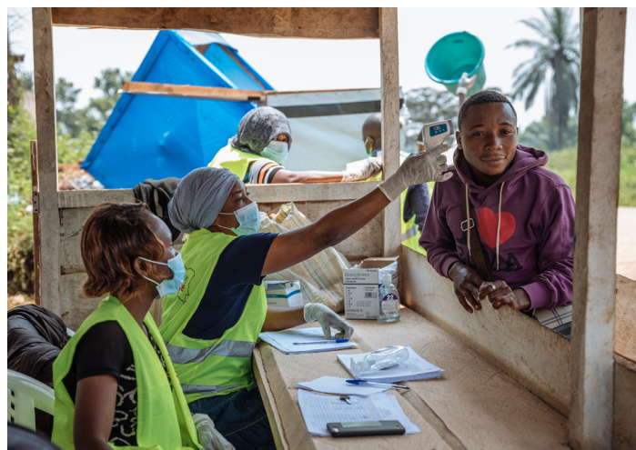
IOM staff provide health screenings to people on the move in Beni, DRC.

IOM's Migration Health Division held an intensive four-day Health in Emergencies training, hosted by the Regional Office for East and the Horn of Africa in Nairobi from 10 to 13 June 2019. The training aimed to build MHD's capacity to effectively prepare for, scale up and respond to public health aspects of humanitarian emergencies, including public health emergencies such as disease outbreaks. MHD has some 1,310 staff globally. The training aims to expand IOM's pool of qualified health staff that can be deployed to support emergency operations. The sessions covered three core modules explaining the Humanitarian Architecture, Global Standards and Needs Assessments, as well as the Humanitarian Programme Cycle. Given the ongoing Ebola outbreak in DRC and the implications for the region, supplemental modules on communicable disease control in emergencies, infection prevention and control and field epidemiology were also included. Given the success and added-value of the training, MHD will be carrying out these trainings annually, either virtually or in-person.