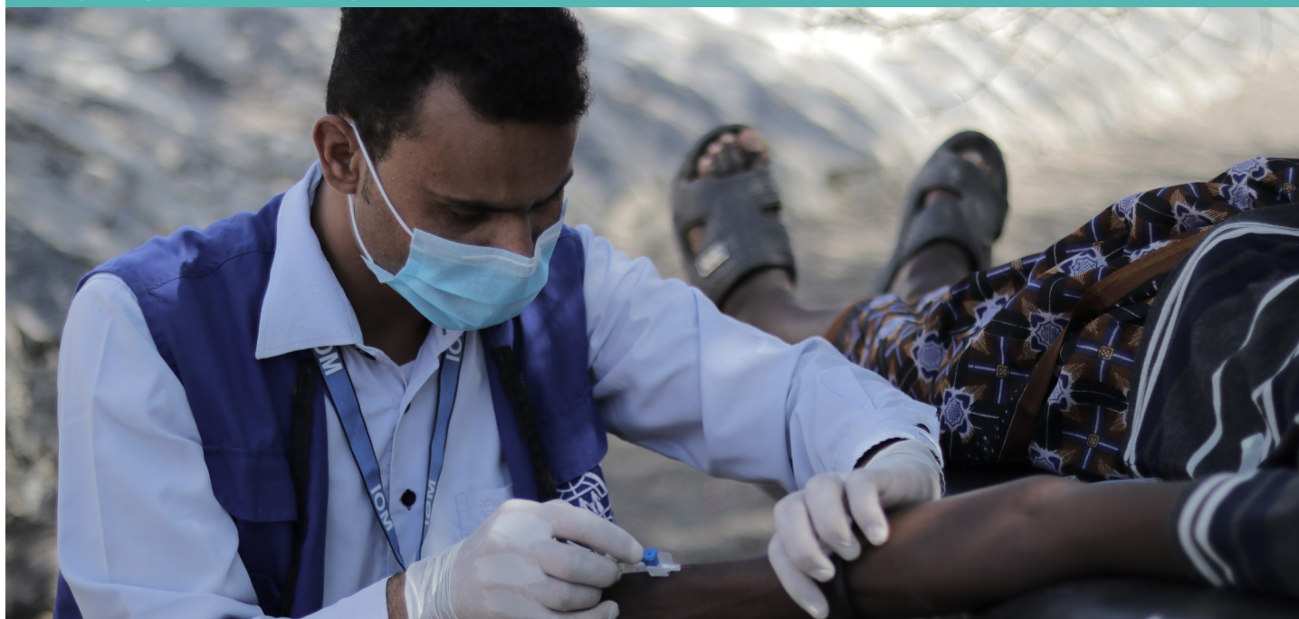
As part of an IOM mobile medical team, a doctor provides emergency health services to a migrant recently arrived in Shabwah on the Yemeni coast.