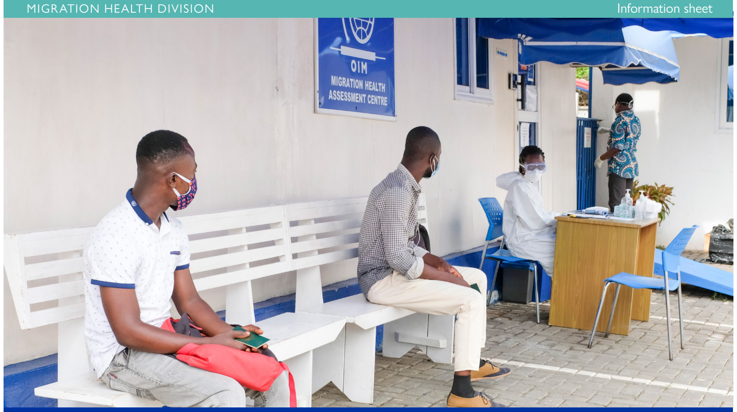
Infection prevention and control (IPC) measures at the IOM Migration Health Assessment Centre (MHAC) in Accra, Ghana.