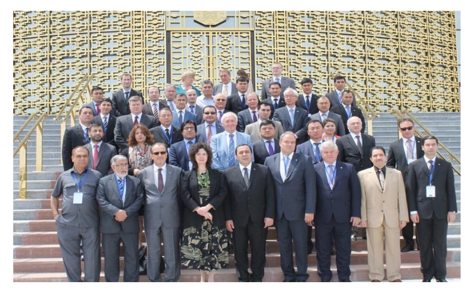
Regional Forum on International Cooperation in the area of Migration and Emergency Preparedness - Ashgabat, Turkmenistan, 17-18 June, 2015