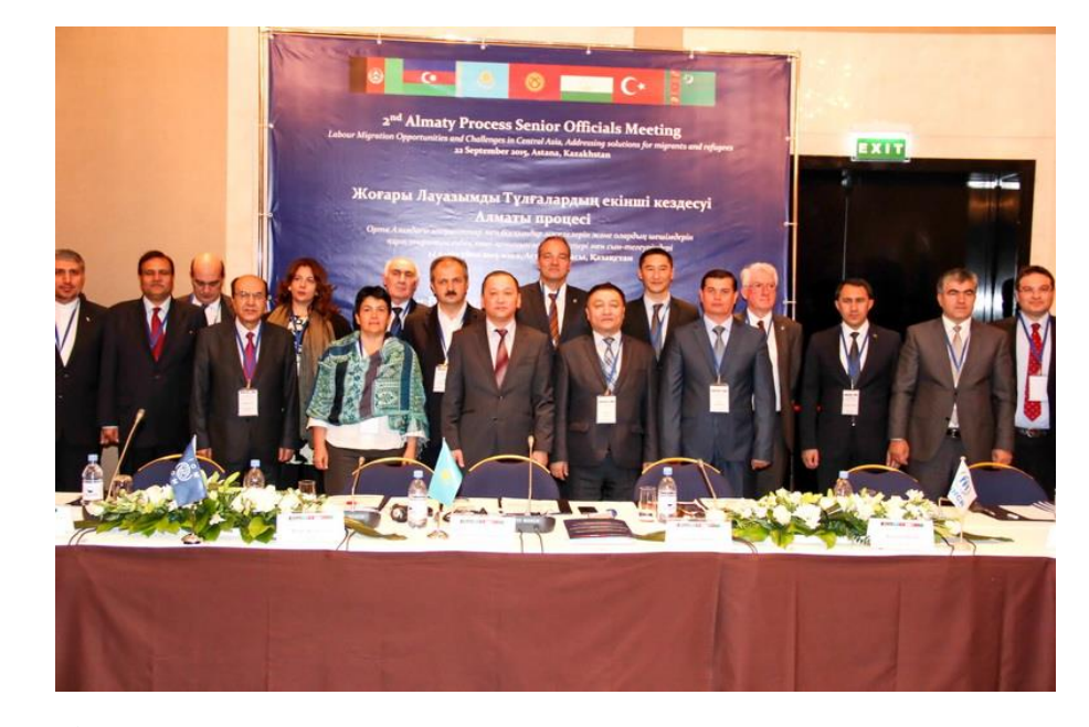
2<sup>nd</sup> Senior Officials Meeting, Astana, Kazakhstan on 22 September, 2015