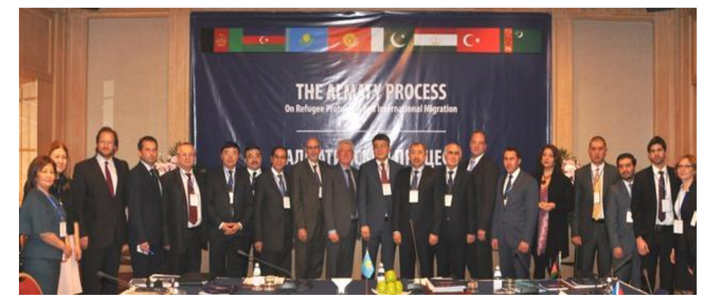
1st Senior Officials Meeting - Almaty, Kazakhstan on 21 November, 2014