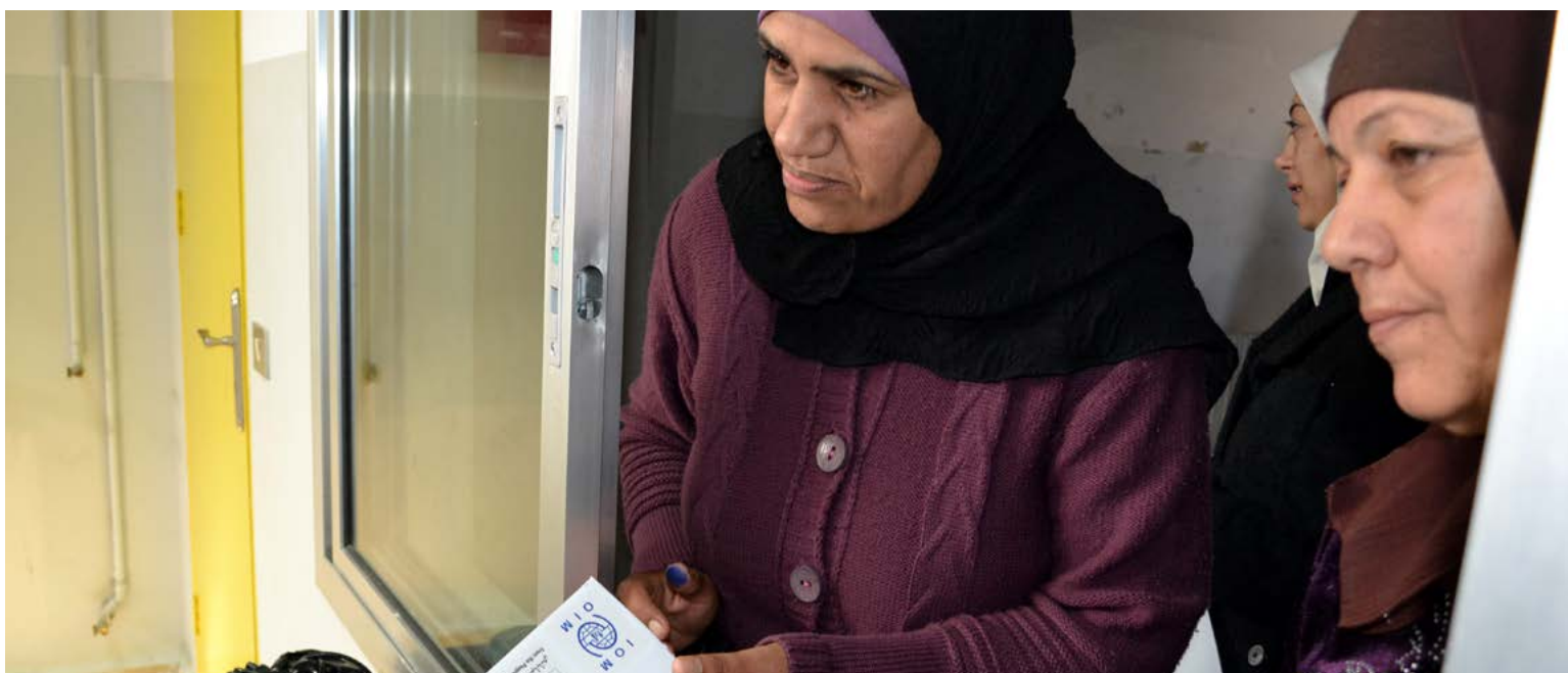
Individuals in Lebanon receive conditional cash grants