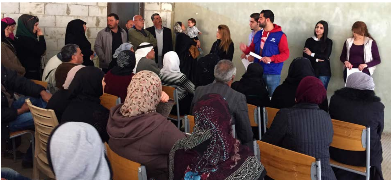
IOM staff and beneficiaries of cash grants at a distribution centre in the Bekaa, Lebanon

Prior to the issuance of the CSC ATM cards, IOM chose to deliver the cash directly to the beneficiaries. To ensure the safety of the distributions no cash was directly distributed in refugee settlements. Instead throughout the assessments, eligible beneficiaries were given a voucher that was redeemable at specified distribution centres and at indicated dates only. To secure these distribution sites, IOM hired unarmed certified private security company and also depended on the support of local municipality staff.