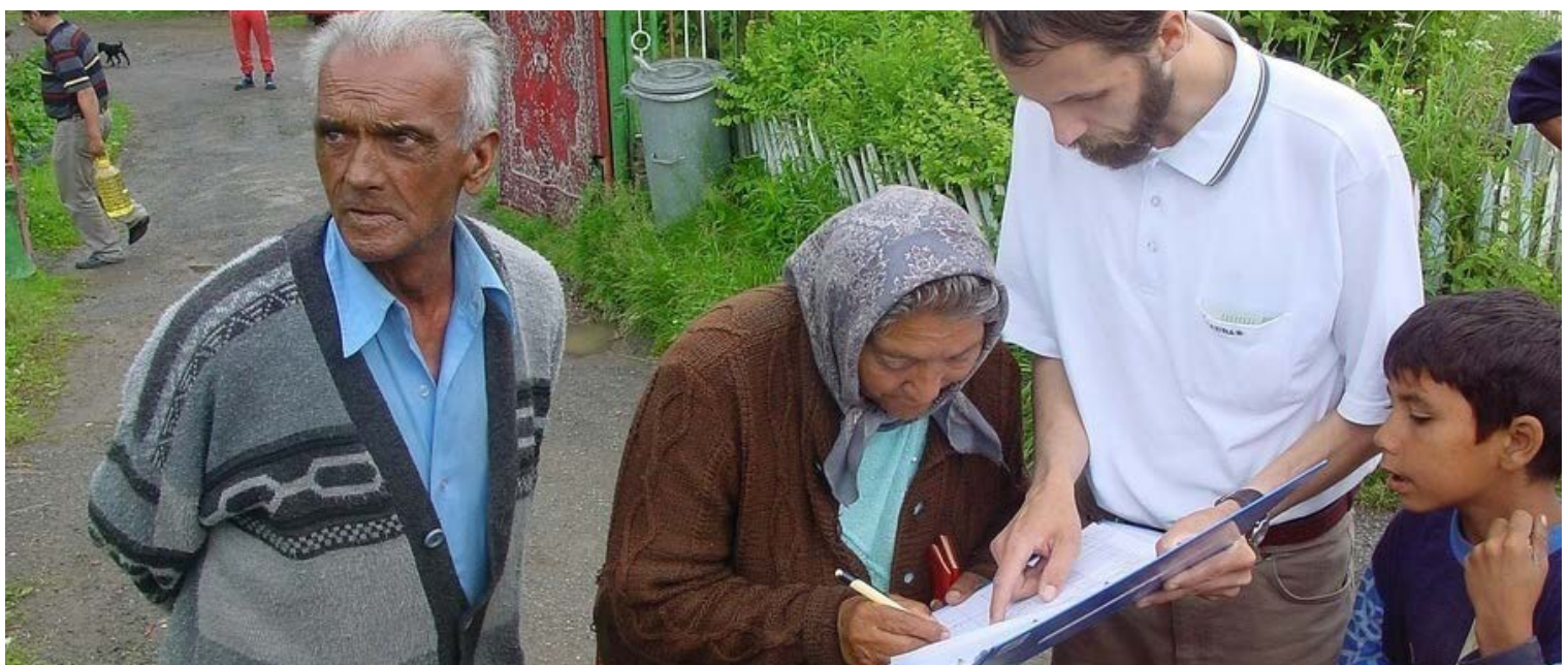
A Roma beneficiary confirms the assistance she received from IOM in Slovakia