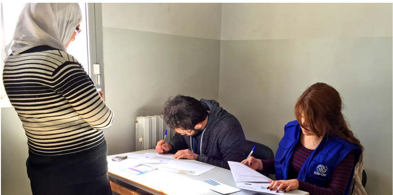
Individual in Lebanon receives conditional cash grant

Post distribution monitoring and evaluation exercises were undertaken every one to two months with each beneficiary family. These involved calling the beneficiaries for feedback on the quality of IOM assistance and performance, and also to evaluate their current situation, needs and vulnerabilities in order to verify eligibility for ongoing assistance (in relation to the cash for rent in particular, which is designed as a temporary support measure). The phone calls were followed by home visits. The findings were also summarized and shared with the Shelter/CCCM coordinator and the emergency coordinator.