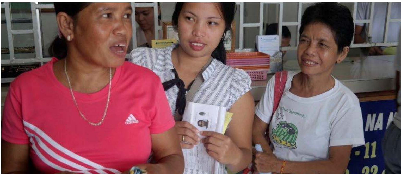
Individuals receive unconditional cash grants in Ormoc, Philippines