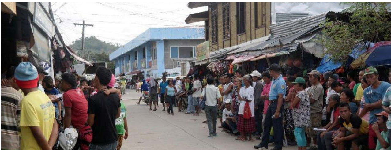
Individuals waiting to receive unconditional cash grants in Villaba, Philippines

to be present at the distribution point (the branch of the remittance agency) to support the process and collect evidence of receipt, in the form of beneficiaries signatures.