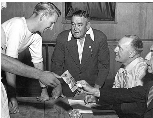
Camp officers of ICEM (now IOM) distributing cash vouchers to newly arrived refugees of the Hungarian uprising

IOM will continue to refine its ability to deliver cash-based transfers quickly and efficiently, where this is determined by assessment to be the appropriate means to the desired ends.