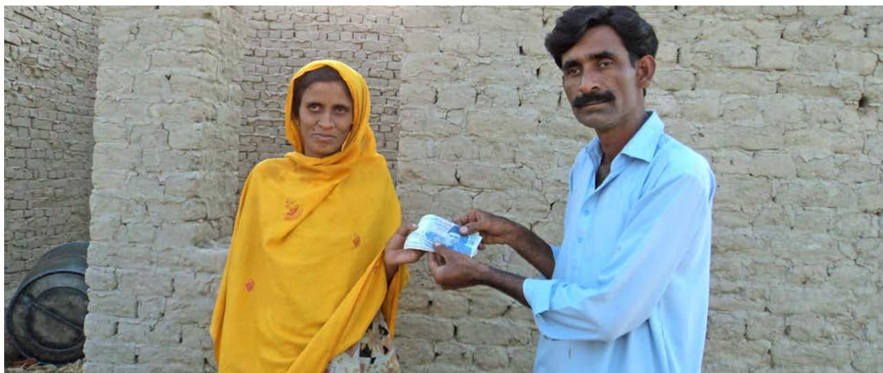
Individuals receive cash-for-shelter in Pakistan

of each construction stage for every beneficiary family. For the first tranche, partners were required to provide the signed or printed agreements between IPs, beneficiaries and focal points, village and household data, photographs of each family by their damaged home, and new building site, and proof of ID (or GPS code) for each beneficiary household.