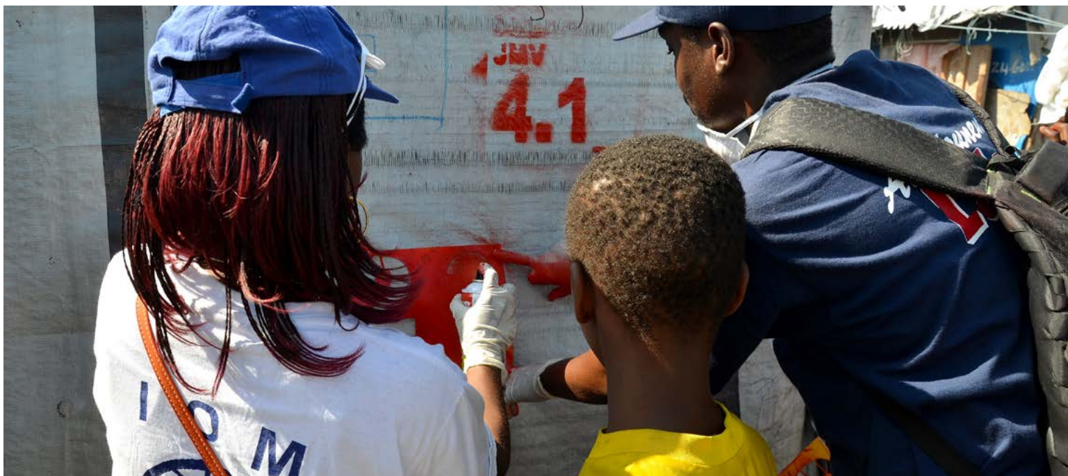
IOM staff marking and dismantling tents in Haiti