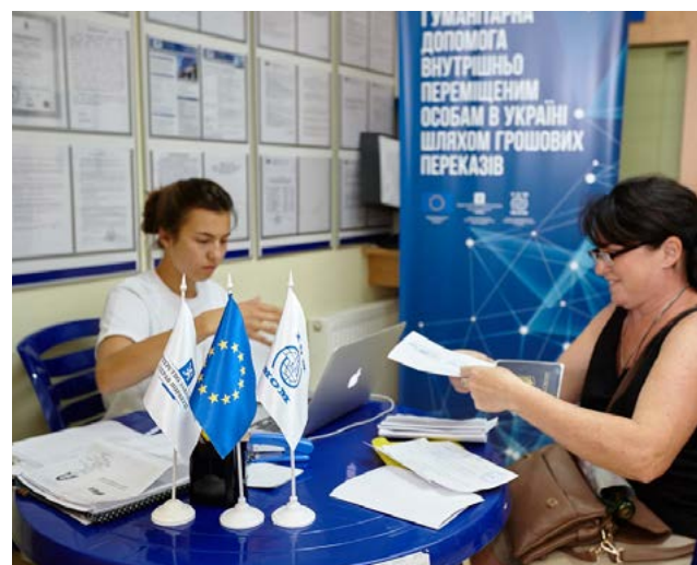
Individual in Ukraine receives unconditional cash grant

IOM received initial beneficiary lists from the Ministry of Social Policy for verification (further detail below). Once verified, eligible households were filtered into batches of 1,000 - or as needed for each distribution - with payment-related information including bank and date of distribution for each beneficiary added into the