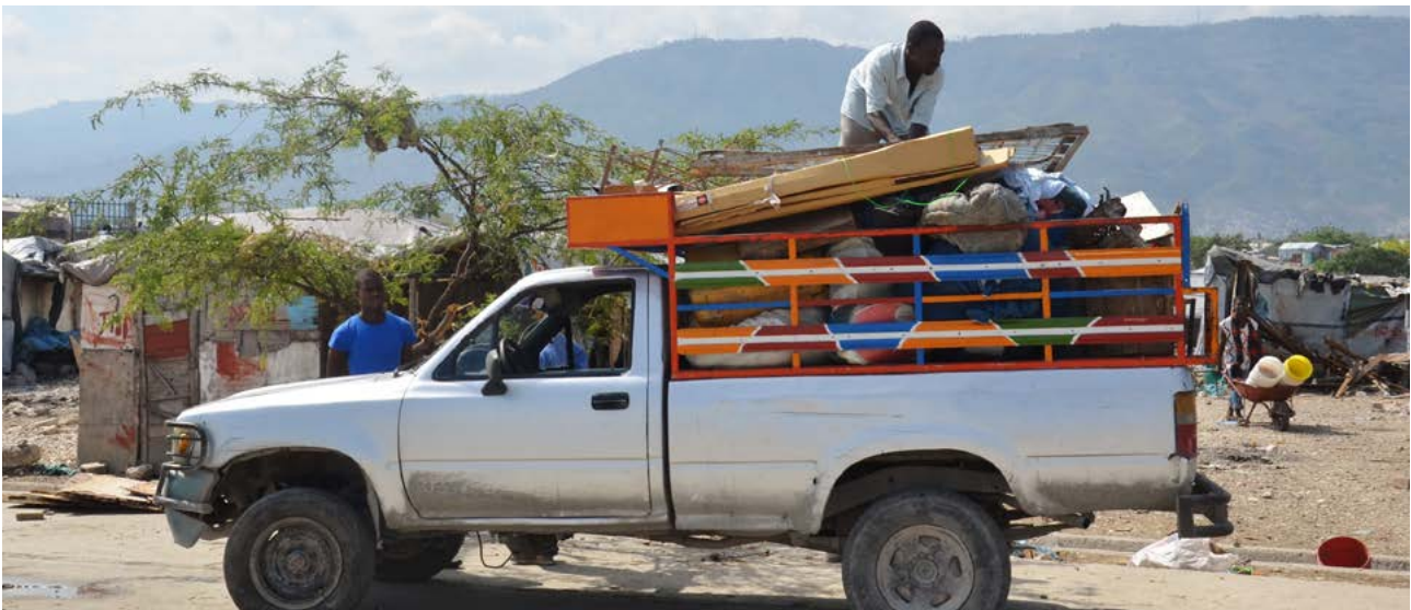
People transporting personal belongings in Port-au-Prince

Families were asked to leave camps within three days of receiving the rental subsidy. The overwhelming majority of families were extremely keen to leave the camp immediately and this timetable did not prove problematic, with the use of the additional USD 25 to assist in transport and moving. For families with special circumstances, flexibility and extra assistance were available.