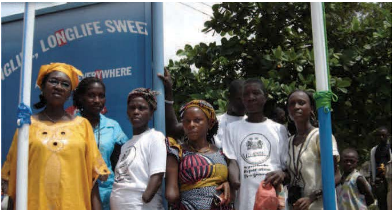
Community Symbolic Reparations event in Makeni, Sierra Leone, in 2009