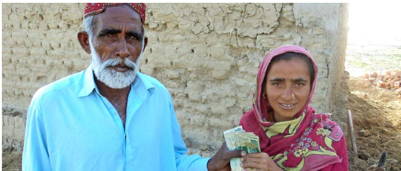
Individuals receive cash-for-shelter in Pakistan

(for example, bamboo costs increasing from PKR 7 / ft to PKR 15 / ft in one village, from PKR 7 - 10 / ft in another).