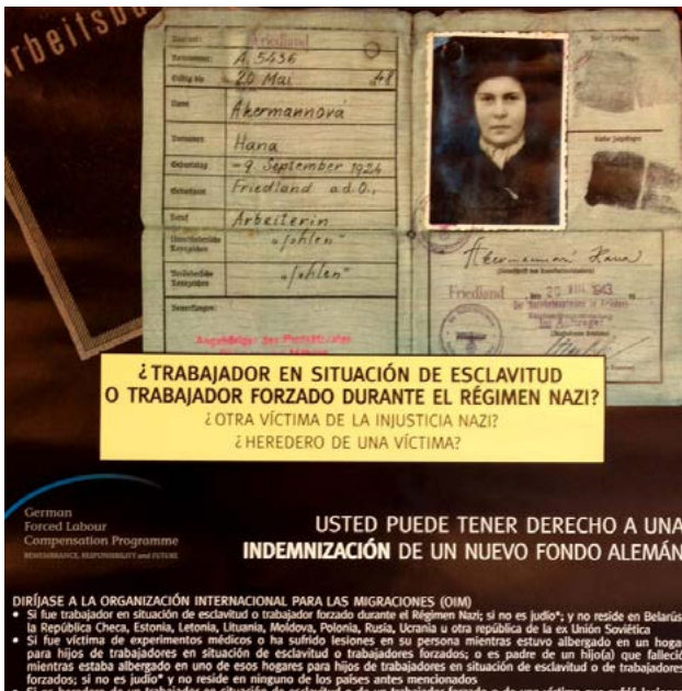
IOM poster for the GFLC Programme in Spanish

11 languages and disbursed a total payment value of USD 32,273,115.