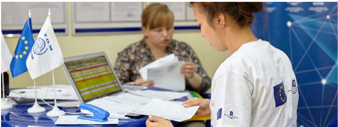
Individuals receive unconditional cash grants in Ukraine