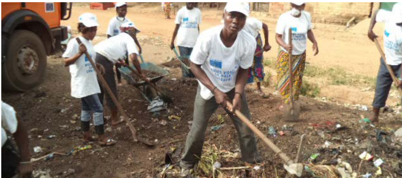
Individuals engage in work to clear garbage in Bangui, Central African Republic