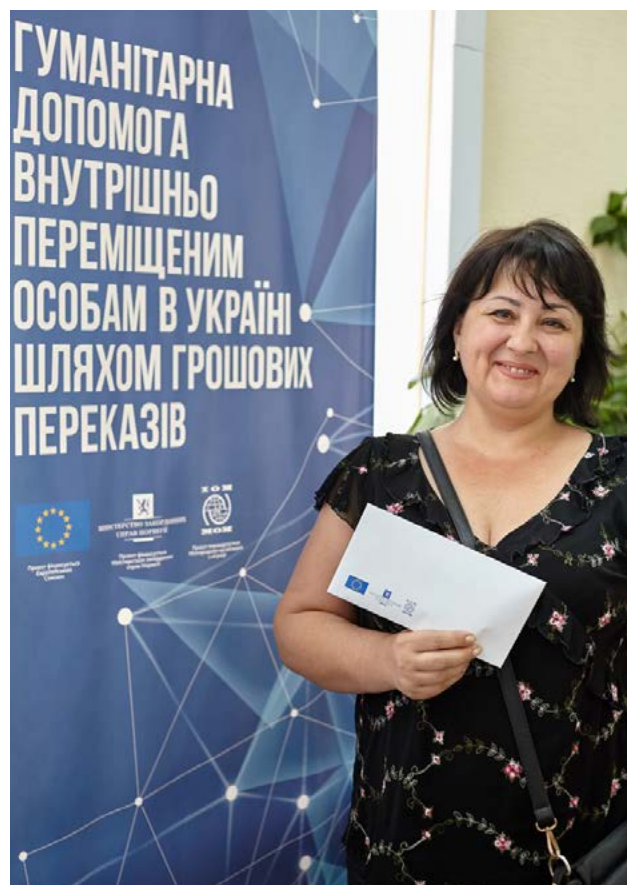
Individual in Ukraine receives unconditional cash grant

To avoid any duplication with other partners, IOM shared the list of beneficiaries and the nature / amount of the assistance they received with the Ministry of Social Policy and - if needed and agreed upon with cluster partners - with UNHCR.