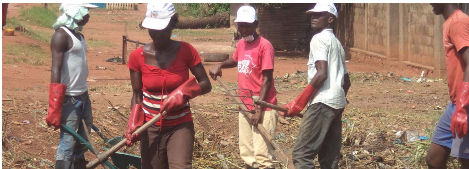
Individuals engage in work to clear weeds and garbage in Bangui, Central African Republic