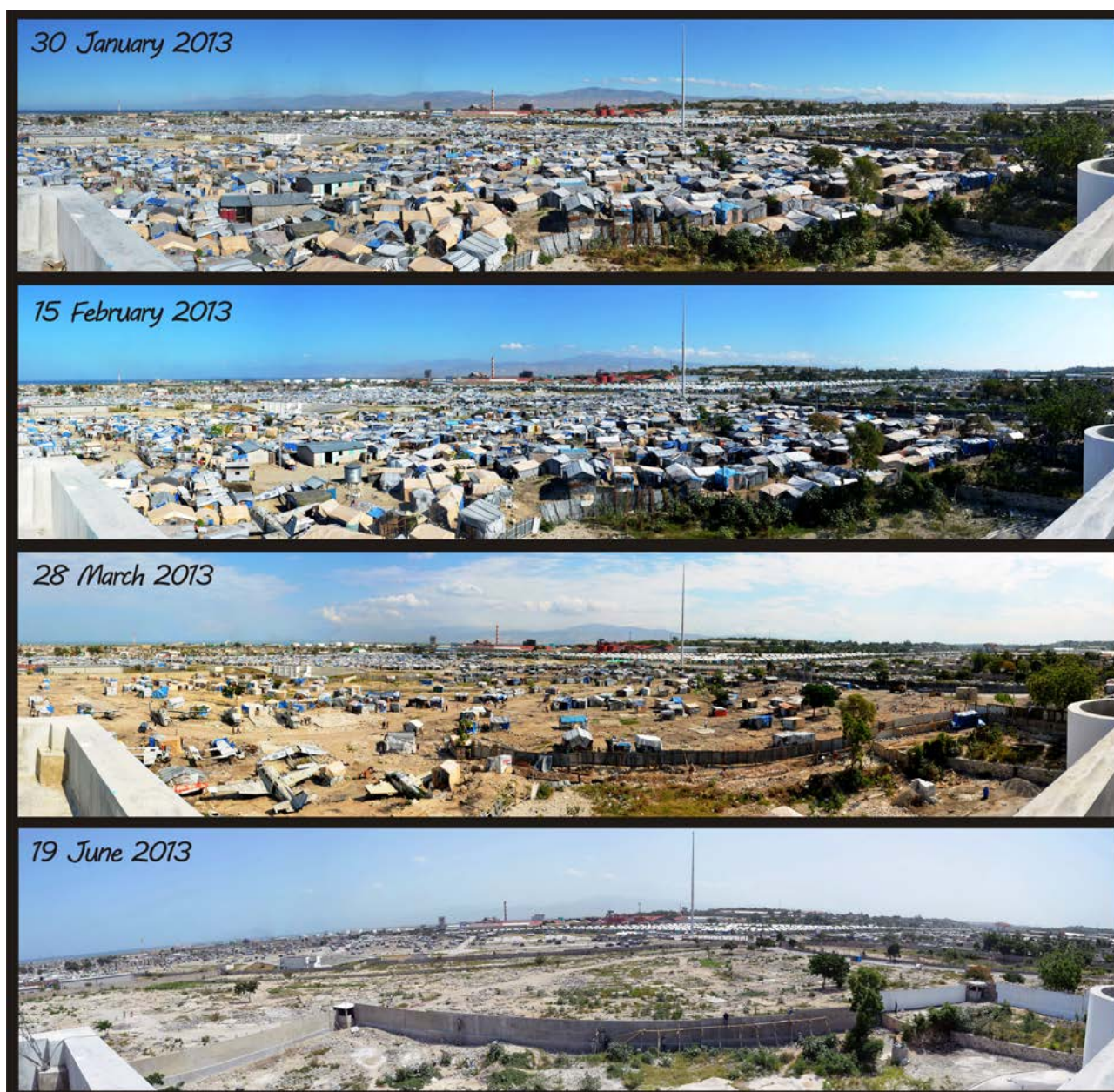
Phases of the return process from a temporary settlement in the former military airport in Haiti

Monitoring of the transfers moving through the programme also improved with the diversification of partners. IOM was able to monitor the transactions via an online platform provided by Unibank and control the status of all planned payments to landlords and beneficiaries in real time.