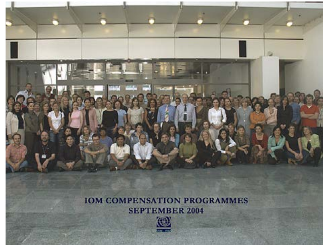
The former Director of IOM's Compensation Programmes bids farewell to his staff in September 2004

Project Description From 2000 to 2007, IOM delivered large scale World War II reparations programmes to victims of the German Reich to the value of USD 480 million. The largest element of the programme provided cash reparation to those who had been subjected to forced or slave labour; smaller funds also provided cash reparation to those who lost property or wealth due to the actions of German companies, and to Holocaust survivors (under the German Foundation "Remembrance, Responsibility and Future", and the Swiss Banks Settlement Fund). IOM received and verified more than 450,000 claims and paid cash grants to 96,656 eligible claimants in about 40 countries, through its global network of country offices, and in coordination with CitiBank.