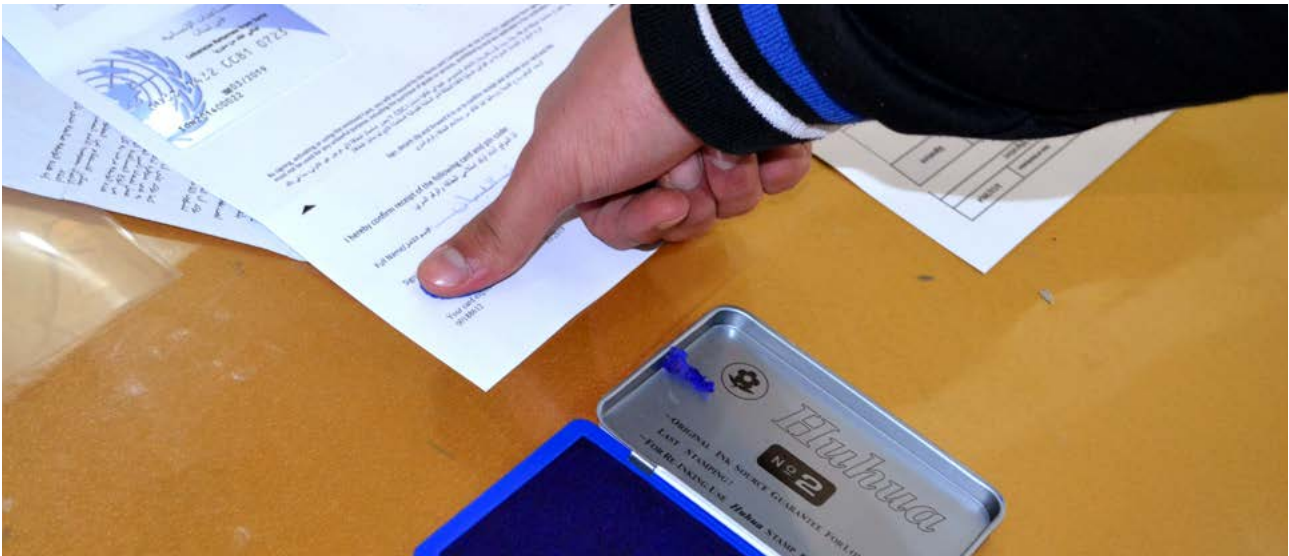
Individual in Lebanon thumb-prints the certificate to receive an ATM card