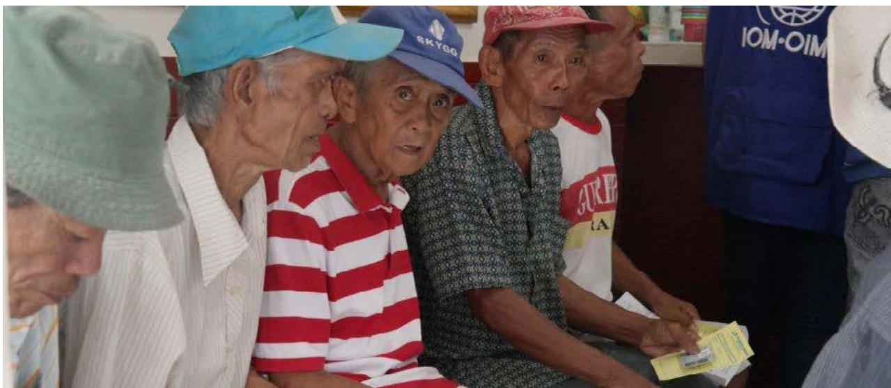
Individuals receive unconditional cash grants in Villaba, Philippines