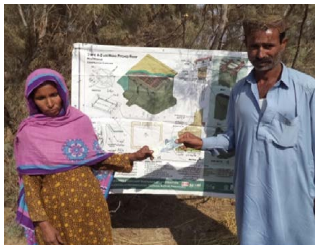
People receive cash-for-shelter vouchers in Pakistan in 2013