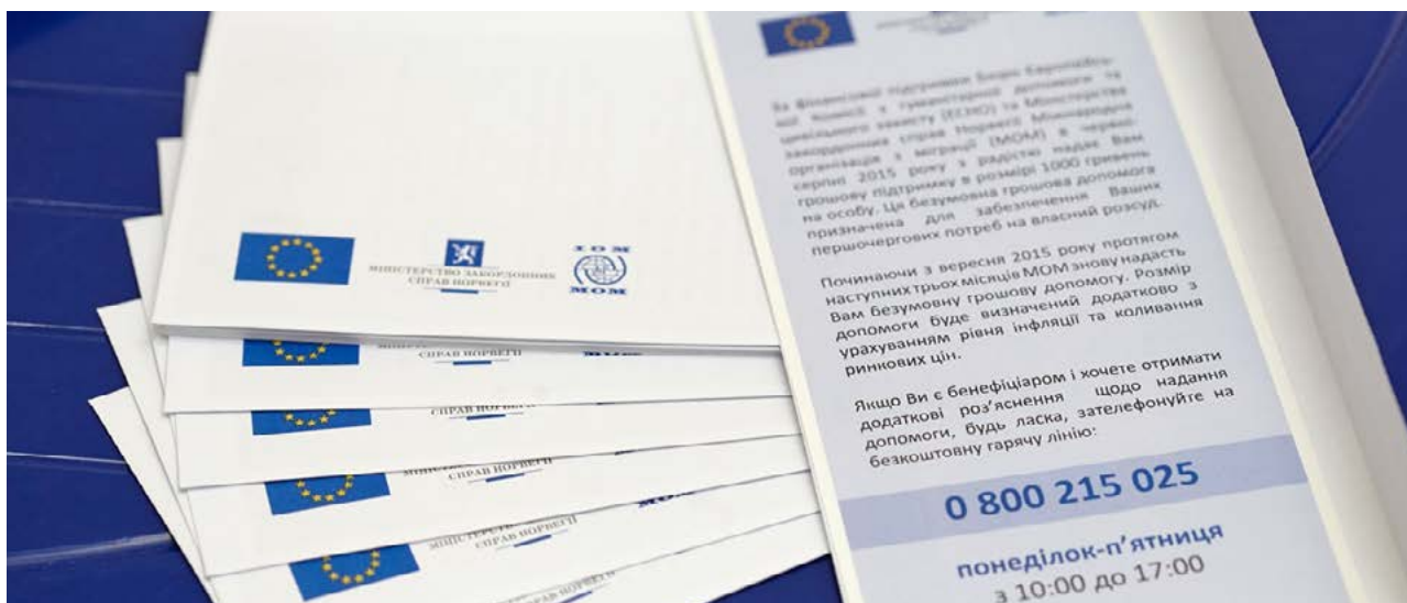
Unconditional cash grants and information leaflets in Ukraine

database, based on the daily capacity of each branch to process payments per day. Information for a sample of beneficiaries was double checked prior to submission of payment lists by conducting house visits, mainly for those having suspicious information.