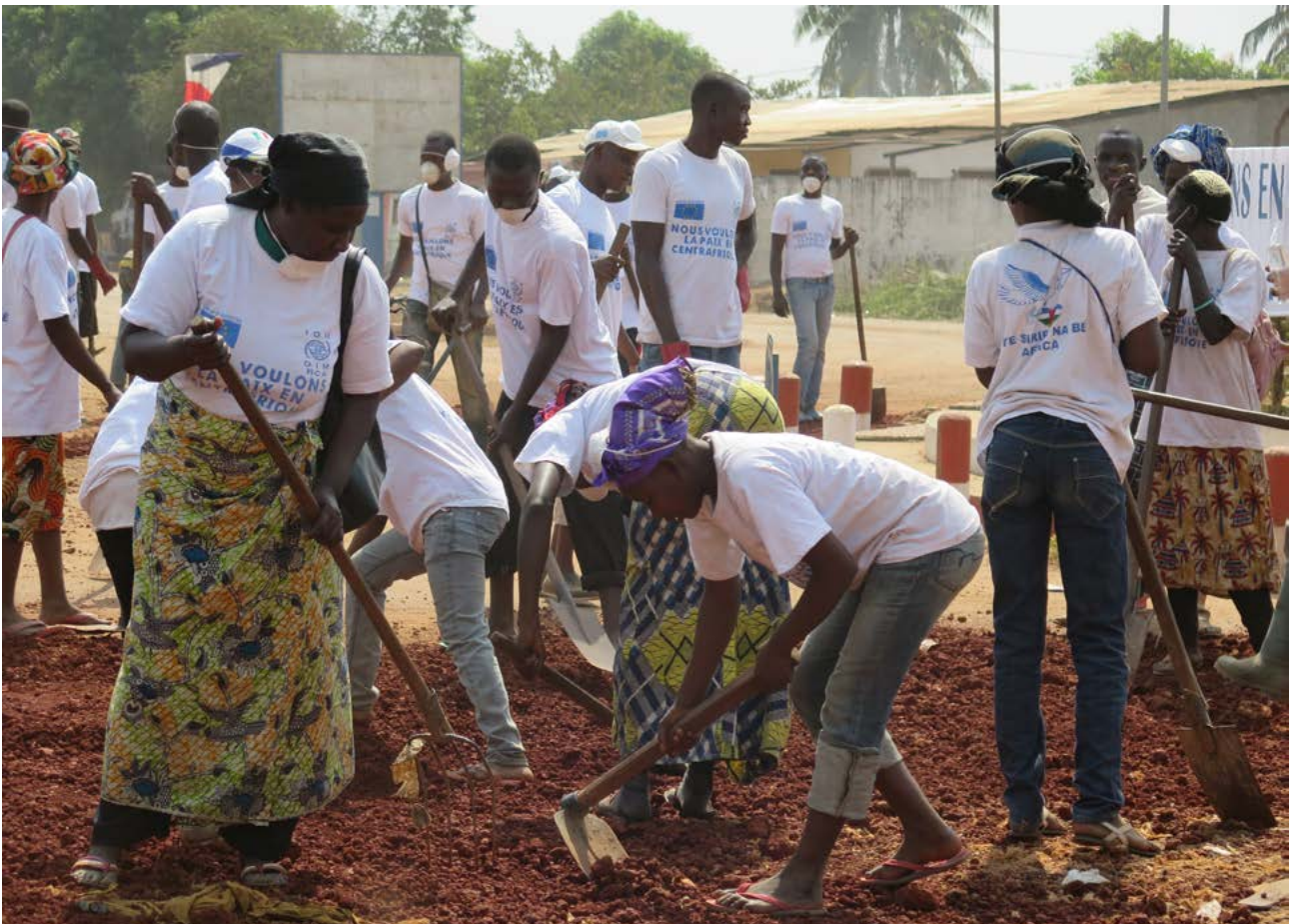
Individuals engage in work in Bangui, Central African Republic

thereby contributed to a continuous exchange of beneficiaries in different neighbourhoods. The participation of women in the activities had to be reinforced, as several chef de quartier refused to recruit women until November 2014. However, with the active participation of the different mayors the women quota is now improving.