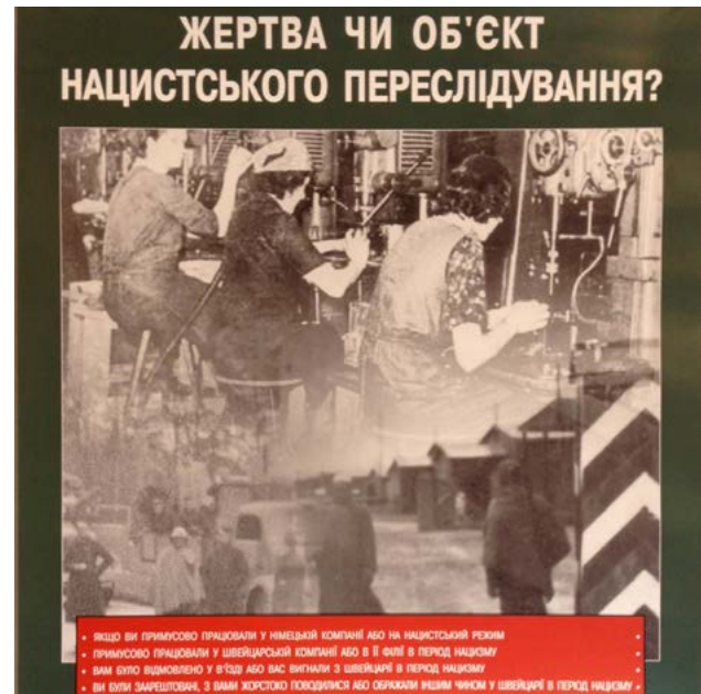
IOM poster for the GFLC Programme in Cyrillic

IOM provided extensive assistance to victims to obtain supporting evidence for their claims through commissioning historic research and