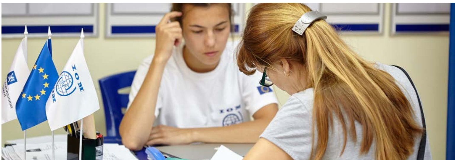
Individuals in Ukraine receive unconditional cash grant

✓ Solution: In Ukraine, a country with well-developed institutions and infrastructure, the out-sourcing key activities enabled rapid delivery of cash (call-centre for verification, bank for transfers). As always in humanitarian programming, this entailed striking a balance between speed and quality, particularly regarding the phone-based verification.