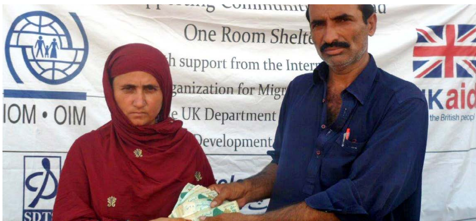
Individuals receive cash-for-shelter grants in Pakistan

Solution: The conditional, performance driven system established by IOM meant that cash payments were made once interim milestones in the construction process had been reached, helping to ensure that shelters were completed. The program required community milestones achievement so to guarantee that vulnerable individuals or those with slower progress be excluded from the program, peer pressure enabled community support to such cases.