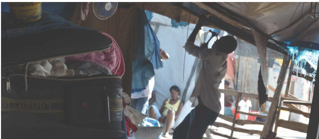
Residents of a self settled camp dismantling their shelter in Haiti

were created for a one-off transaction at a local branch of the bank (which had only one payment point for the entire city of Port-au-Prince). To withdraw the cash, the beneficiaries needed a formal ID and a pin code, which was provided individually to each landlord and beneficiary family. Some families required extra help with this process, including those who had no form of identification. Those were assisted under the condition that a dedicated IOM focal point would confirm the beneficiary identity and vouch for him/her.