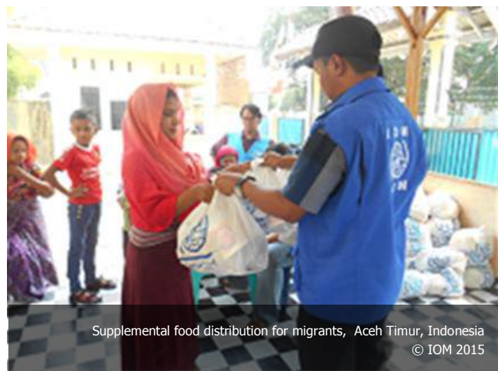
Supplemental food distribution for migrants, Aceh Timur, Indonesia

During August, IOM continued to provide nutritious food and multivitamins for all migrants. In addition to regular daily meals, IOM through the local health clinic (Puskesmas) also distributed 250ml of fresh milk every day.