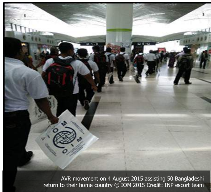
AVR movement on 4 August 2015 assisting 50 Bangladeshi return to their home country

In August, IOM Indonesia has assisted five groups of Bangladeshis (204 migrants) with their return to their home country, bringing the total assisted under the AVR programme running since June to 621 migrants.