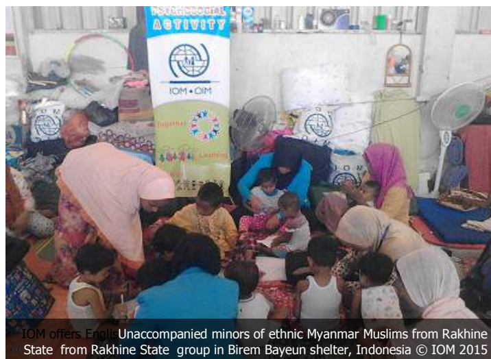
IOM offers English Unaccompanied minors of ethnic Myanmar Muslims from Rakhine State from Rakhine State group in Birem Bayeun shelter, Indonesia

IOM provided extensive sanitation improvement support in all shelter locations. 77 temporary toilets and 32 washrooms were installed; 23 permanent toilets were built; 27 water tanks, 9 water pumps, 65 water taps and 5 water dispensers were also installed. In three locations, IOM is supplying water through water trucks on a daily basis. To date,