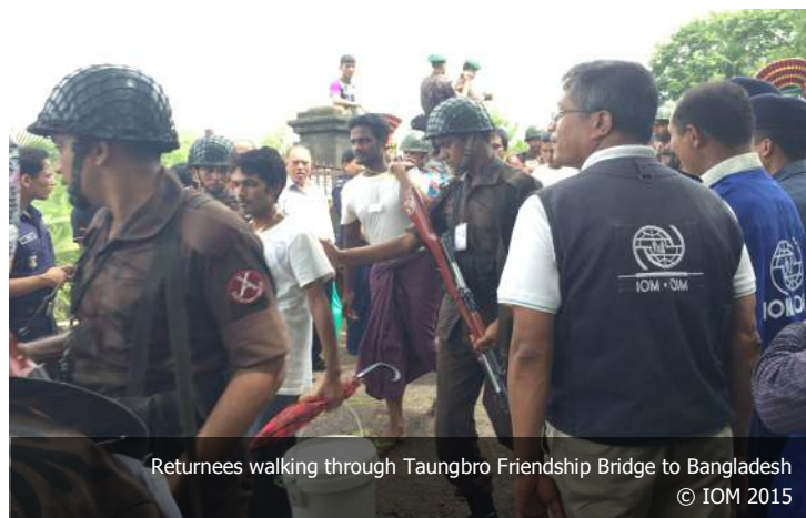
Returnees walking through Taungbro Friendship Bridge to Bangladesh

Advocacy continues with the Bangladesh Consul and Embassy to expedite the returns for the remaining caseload. IOM met with the Bangladesh Ambassador and senior Embassy staff in Yangon on 27 August. The Embassy has committed to facilitate the speedy return of the remaining migrants in Taung Pyo (Rakhine State). Of this group, the majority have been identified as Bangladesh citizens and return procedures are underway. The Embassy is waiting for confirmation from Bangladesh Ministry of Foreign Affairs on the status of the remaining including women and children). The Consul and three Embassy staff visited Zarni Island (Thaninthayi Region) recently where the migrants are being housed—is a deserted island close to the Myanmar navy base. Photos of the island he showed to IOM us show a decent location, basic tents and facilities, and local health services being provided from District Health staff who visit daily from a hospital on the mainland.