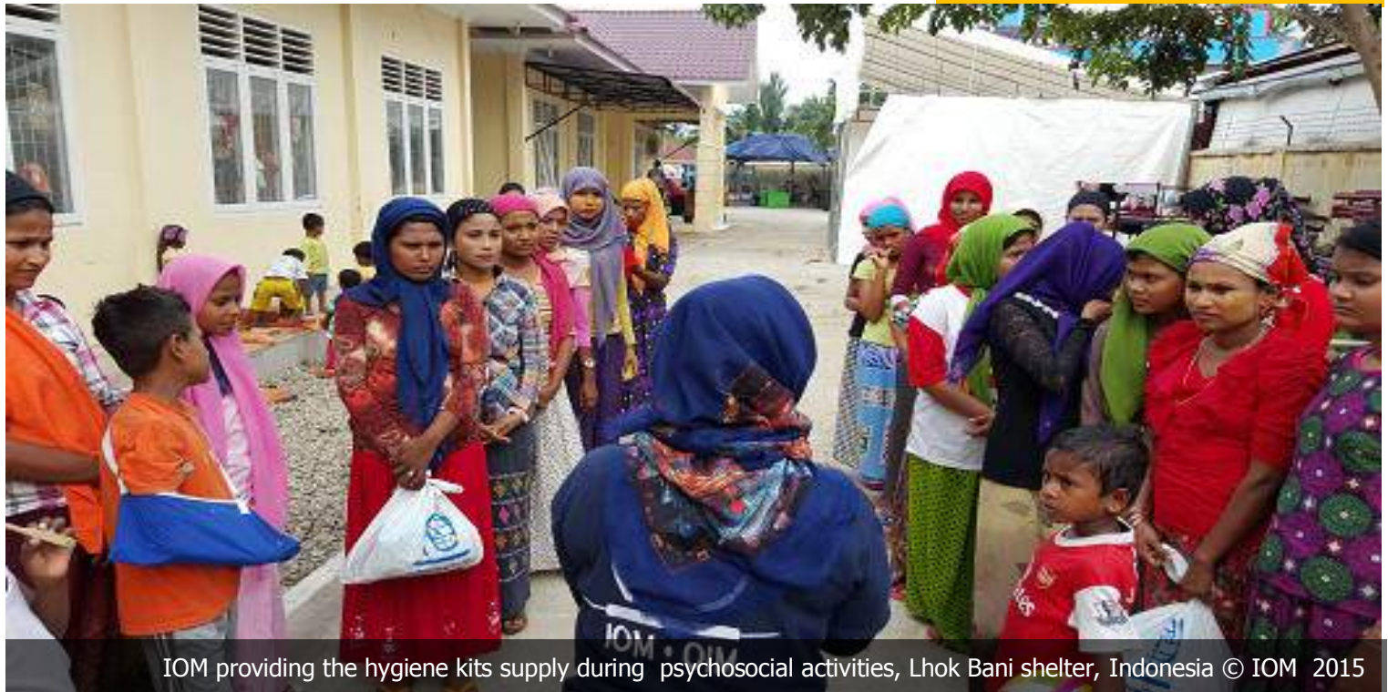
IOM providing the hygiene kits supply during psychosocial activities, Lhok Bani shelter, Indonesia