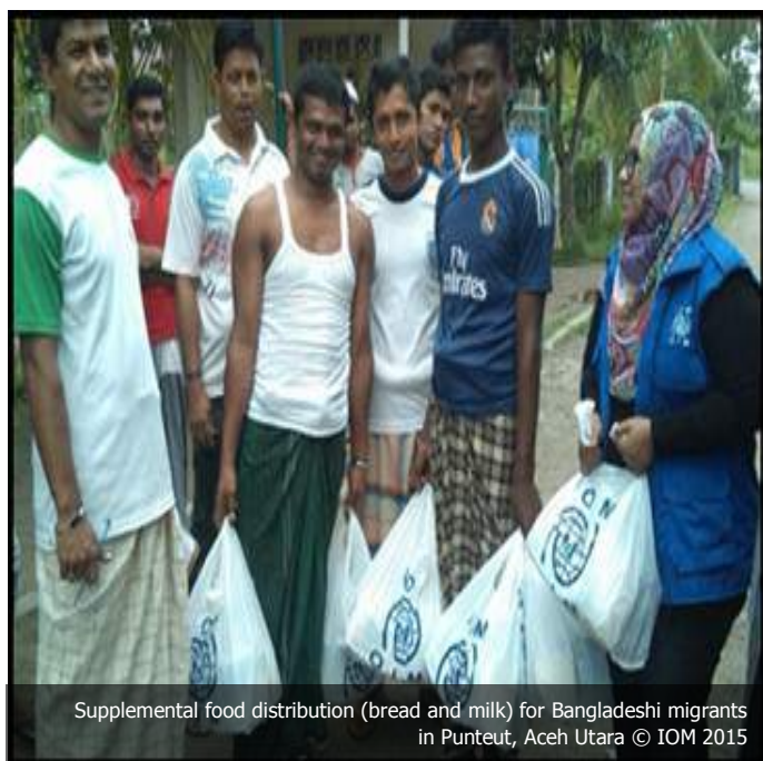
Supplemental food distribution (bread and milk) for Bangladeshi migrants in Punteut, Aceh Utara