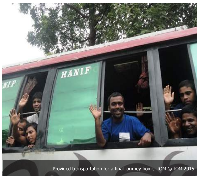
Provided transportation for a final journey home