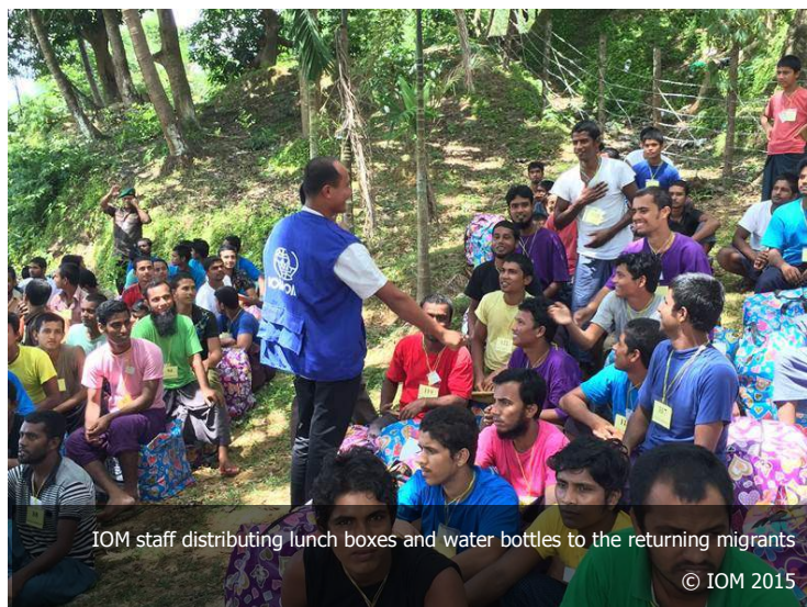
IOM staff distributing lunch boxes and water bottles to the returning migrants

MSF continues to provide ongoing health support but has reduced its involvement as the overall situation remains stable and there are only minor health cases being reported. The Ministry of Health is in overall control and emergencies can be handled by the station hospital. IOM is deploying psycho-social counselors to help assess the new arrivals, and MSF maintains two psychosocial counselors who visit 3 times per week and implements additional activities such as sports.