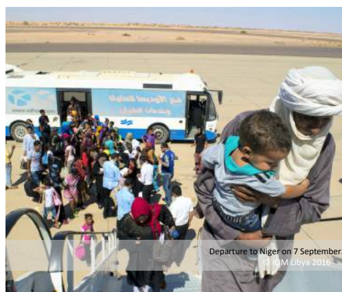
Departure to Niger on 7 September. IOM Libya 2016

"War took two of my sons and destroyed our house and caused me health problems but I cannot return to Niger because of my tribal affiliation and the lack of the necessary money. This trip provides me and my family with a new beginning, we will at least be safe!"