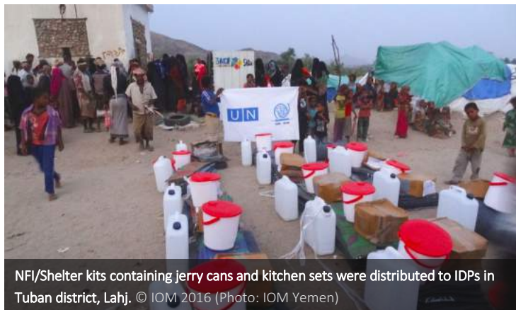
NFI/Shelter kits containing jerry cans and kitchen sets were distributed to IDPs in Tuban district, Lahj.

Since March 2015, IOM has assisted 64,934 IDPs in Abyan, Aden, Al Dhale'e, Hadhramaut, Hajjah, Lahj, Al Mahrah, Sa'adah, Shabwah, Socotra and Taizz governorates with shelter and NFI support.