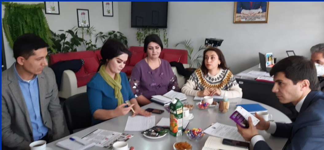
Photo of the multisectoral working meeting on promoting migrants' health, 21 January 2021

On 21 January 2021, IOM Tajikistan took part in the multisectoral working meeting on promoting migrants' health. The meeting was initiated by the Republican Center on Healthy Lifestyle Promotion and was attended by representatives of the Tajikistan Red Crescent, National centers on Tuberculosis and AIDS Control and migration services. Participants raised the need for the multisectoral Joint Action Plan on promoting migrants' health and suggested possible activities for 2021. IOM shared experience on multisectoral approach to address health needs of migrants that include peer education, working with Tajik diaspora and outreach work in the Russian Federation and the Republic of Tajikistan jointly with migration services. Participants highlighted the good quality of the recent brochure on the prevention of STIs and HIV among migrant workers that IOM Tajikistan developed jointly with the national partners. Tajik Red Crescent asked for the electronic version of the IOM brochure to publish additional copies for distribution among returned Tajik migrants in the Sughd Oblast. During the discussion, national specialists asked IOM for the technical support in developing multisectoral Joint Action Plan for 2021 and new National Programme on Promoting Healthy Lifestyle.