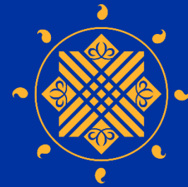
АЛМАТИНСКИЙ ПРОЦЕСС ALMATY PROCESS

On 27 January 2021, the IOM and the UNHCR organized the Ministerial Conference of the Almaty Process to discuss solutions to regional challenges posed by the complex dynamics of refugee protection and migration in Central Asia, exacerbated by the COVID-19 pandemic. The Almaty Process brought together high-level officials of member states and observers: The Islamic Republic of Afghanistan, the Republic of Azerbaijan, the Republic of Kazakhstan, the Kyrgyz Republic, the Republic of Tajikistan, the Republic of Turkey, Turkmenistan, the Islamic Republic of Iran, the Islamic Republic of Pakistan, the Republic of Uzbekistan to discuss results of joint work achieved so far and future activities to support migrants and refugees in the region.