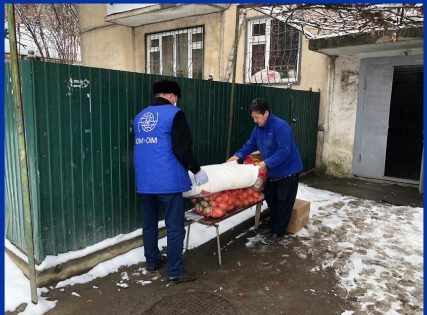
Photo of a Kyrgyz migrant receives food aid

As part of “Community Stabilization through Returned Migrant Reintegration in Kyrgyzstan and Tajikistan during and after COVID-19” Project, IOM-Kyrgyzstan and IOM’s NGO partners have trained 39 local authorities and social workers in six pilot districts in Osh, Batken and Jalal-Abad regions on reintegration of returning migrants. The training was based on the earlier developed Reintegration Handbook both in Russian and Kyrgyz that includes economic, social, psychosocial, and COVID-19 modules.