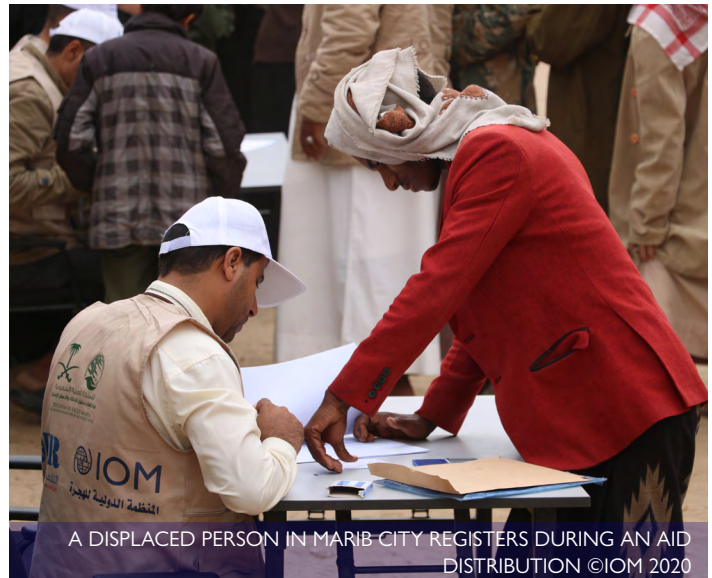
A DISPLACED PERSON IN MARIB-CITY REGISTERS DURING AN AID DISTRIBUTION

To monitor displacements and needs, and coordinate service provision in Marib, IOM and the Executive Unit for IDP Camp Management are co-chairing a regular emergency coordination forum, along with non-governmental organizations (NGOs), to identify and respond to needs in the priority sectors of CCCM, S-NFI, WASH, FSL and health. The Executive Unit, in coordination with IOM, is sharing a daily response tracker with humanitarian partners, which details partner response activities. IOM is leading the identification of new displacement locations and shares daily updates with national and humanitarian partners.