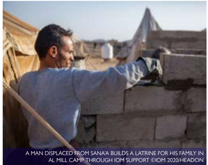
A MAN DISPLACED FROM SANA'A BUILDS A LATRINE FOR HIS FAMILY IN AL MILL CAMP THROUGH IOM SUPPORT