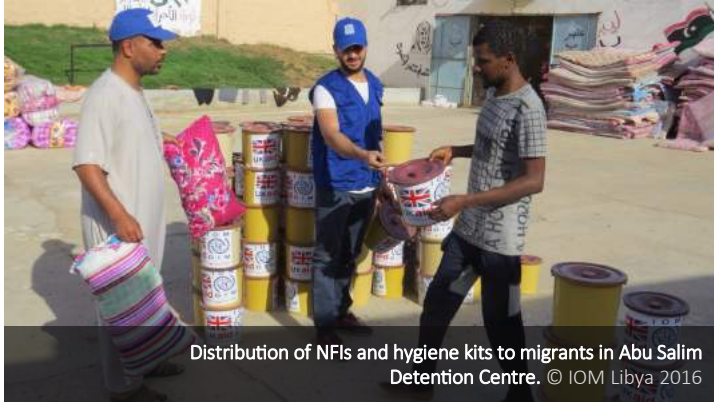
Distribution of NFIs and hygiene kits to migrants in Abu Salim Detention Centre.

screened and treated. During the medical team visits, 21 migrants from Nigeria (7), Senegal (6), Gambia (5), Ghana (2), and Côte d'Ivoire (1) living in Az Zawiyah centre were screened and received medication. In Al-Khums Detention Centre, 13 migrants from Somalia (8), Mali (2), Niger (2), and Nigeria (1) were treated on 6 July, and one Nigerian migrant in Sabratah Detention Centre was screened.