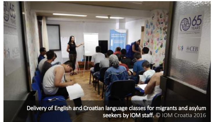
Delivery of English and Croatian language classes for migrants and asylum seekers by IOM staff.

migrants and asylum seekers currently accommodated at the RCAS in Zagreb. The installation of the items is currently underway. Weather appropriate clothes and footwear for the migrants have been purchased and will be distributed in the next reporting period. An assessment with the focus on how to improve housing and living conditions is currently underway at the RCAS in Kutina.