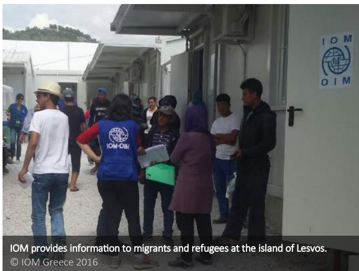
IOM provides information to migrants and refugees at the island of Lesvos.

As of 13 July, IOM has assisted 2,218 beneficiaries under the EU relocation programme. In the pre-departure phase, IOM conducted health assessments to ensure that beneficiaries travel in safety. Furthermore, IOM organized pre-departure and cultural orientation sessions, providing information, on their rights and obligations, on what to expect when they arrive, as well as pre-embarkation information.