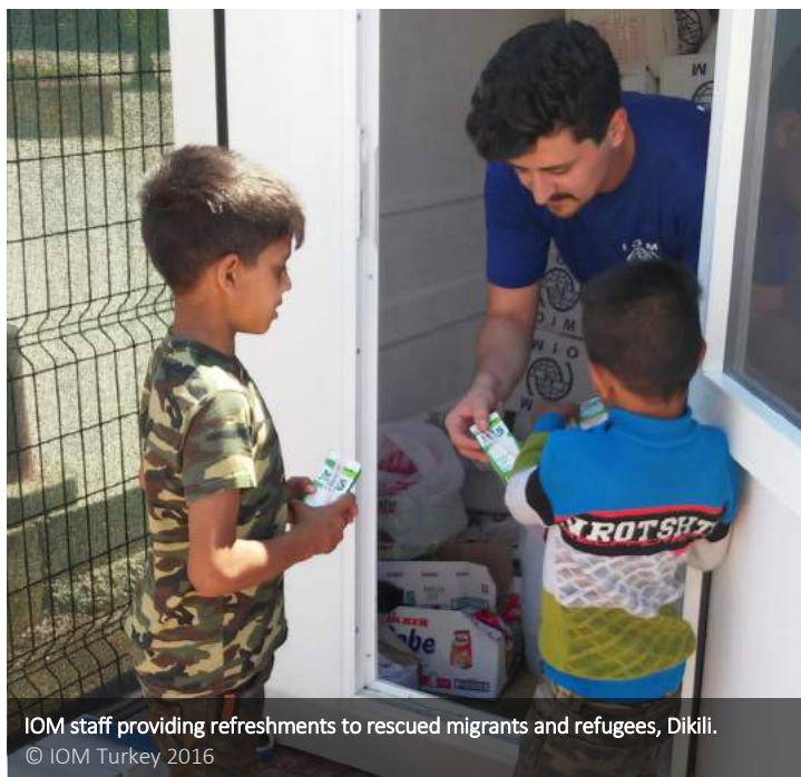
IOM staff providing refreshments to rescued migrants and refugees, Dikili.

IOM supports the Turkish Coast Guard (TCG) by distributing food, water, and non-food items (NFIs) to rescued migrants and refugees. During the reporting period, IOM assisted the TCG in Dikili -one of the points in İzmir for irregular migrants and refugees to cross to Lesvos- through the provision of food, water and NFIs (including blankets, clothing and shoes) for 58 migrants and refugees who were rescued at sea. The majority of those rescued at sea in Dikili came from Syria and Iraq.