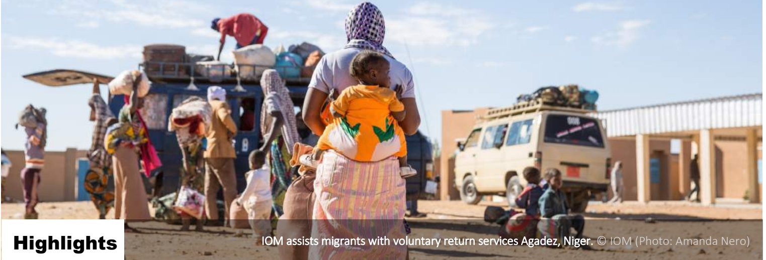
IOM assists migrants with voluntary return services Agadez, Niger. © IOM (Photo: Amanda Nero)