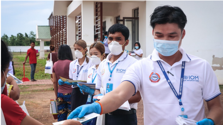
IOM distributing Information, Education and Communication (IEC) materials to returning migrants.