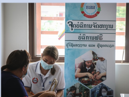
IOM interviewing a migrant in quarantine.