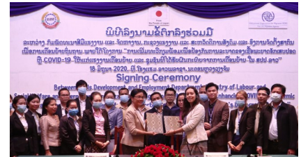
Project Launch Ceremony at Vientiane Capital.