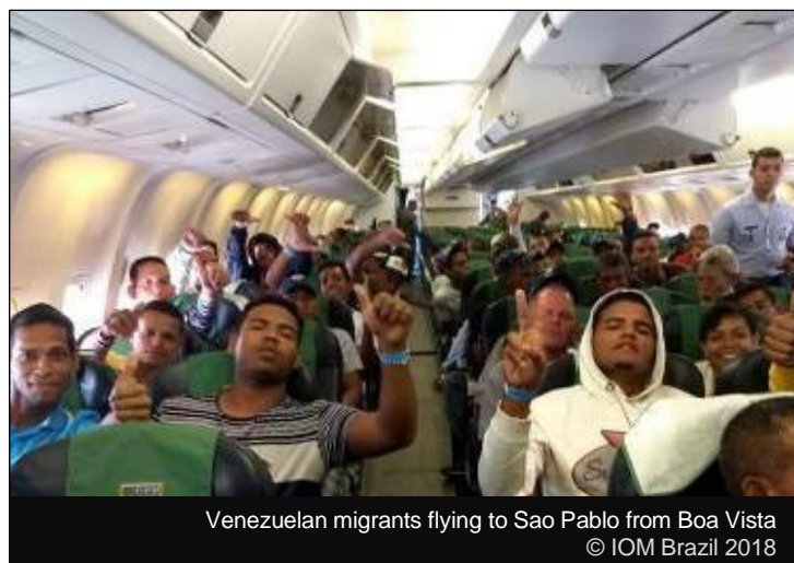
Venezuelan migrants flying to Sao Pablo from Boa Vista

IOM supported the Government of Brazil in the first round of voluntary internal relocation of Venezuelan nationals, which re-located 265 Venezuelan nationals from Roraima to other states in the country. IOM country office in Brazil was officially established only in 2016 but has already increased its operational capacity and field presence and has since been fully engaged in the response to the arrival of Venezuelan nationals in Roraima.