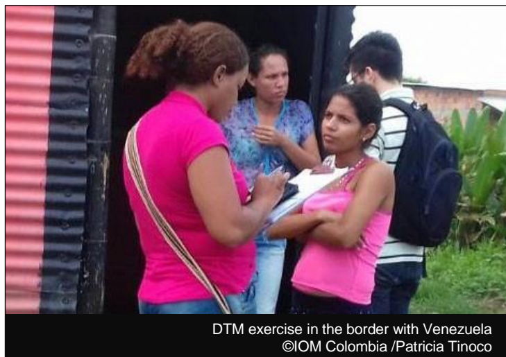
DTM exercise in the border with Venezuela

In parallel, IOM Headquarters' teams have been providing methodological guidance to regional and country offices planning DTM operations under the RAP to secure context relevant adaptation and a consistent application across countries. For more information on DTM please visit https://displacement.iom.int .