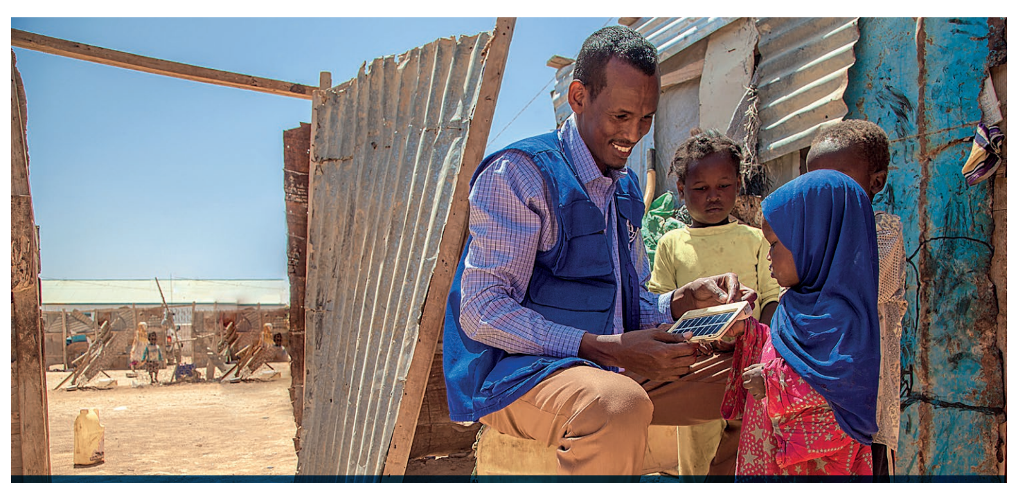
NE OF IOM'S HEALTH FACILITIES IN JOWLE IDP SETTLEMENT (GAROWE, PUNTLAND), WHICH PROVIDES HEALTH SERVICES TO INDIVIDUALS AND THEIR AFFECTED COMMUNITIES LIVING AND AROUND SEVEN IDP SETTLEMENTS ACROSS SOMALIA. IN ORDER TO BUILD THE CAPACITY OF THE GOVERNMENT'S HEALTH SYSTEMS, IOM RECRUITS HEALTHCARE PROVIDERS OM THE MINISTRY OF HEALTH TO RUN THE HEALTH FACILITIES, AND PROVIDES THEM WITH TRAINING AND TECHNICAL SUPPORT.