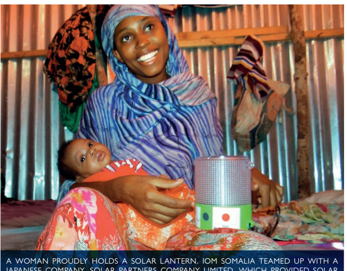
A WOMAN PROUDLY HOLDS A SOLAR LANTERN, IOM SOMALIA TEAMED UP WITH A JAPANESE COMPANY, SOLAR PARTNERS COMPANY LIMITED, WHICH PROVIDED SOLAR LANTERNS TO IDP CAMPS IN SOMALIA TO IMPROVE SECURITY, PARTICULARLY FOR WOMEN. THE PARTNERSHIP IS ONE OF SEVERAL INNOVATIVE PUBLIC-PRIVATE PARTNERSHIPS THAT SUPPORT IOM'S WORK WITH DISPLACED POPULATIONS AND AFFECTED COMMUNITIES IN SOMALIA, SUCH AS WITH PANASONIC AND POLY-GLU SOCIAL BUSINESS.

IOM collaborates with national and local authorities on preparedness and prevention, including disaster risk reduction plans, planning for mass evacuations, disaster management, and support for strategic, contextual and contingency planning in a crisis (e.g. planned relocations). In order to help mitigate the root causes of displacement and to minimize the impacts of external shocks, IOM activities cover conflict sensitivity, risk analysis, disaster risk reduction and resilience-building and provide support for States and communities to establish community-level resilience strategies. As the majority of persons displaced by disasters, environmental degradation and climate change typically remain within State borders, IOM is also developing programmes relating to climate change and environmental sustainability. It is applying its stabilization and development principled programming in at-risk contexts and in order to create environments conducive to return so as to reduce the risk of renewed displacement.