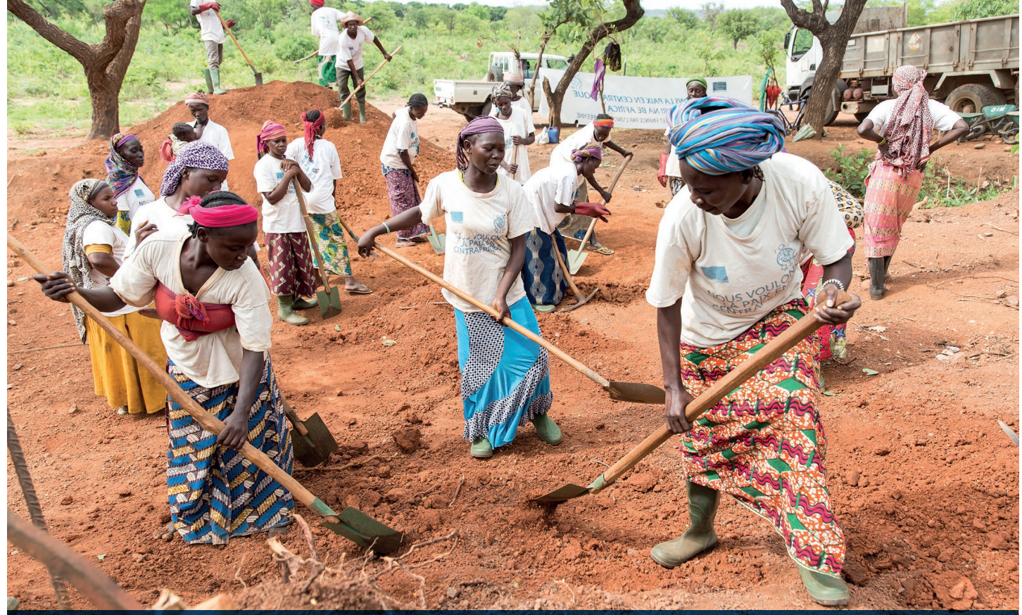
ONGOING SINCE 2014, IOM'S COMMUNITY STABILIZATION AND EARLY RECOVERY PROJECT SIRIRI, FOCUSES ON REVITALIZING LOCAL MARKETS INCLUDING THROUGH CASH-FOR-WORK ACTIVITIES; REHABILITATION OF COMMUNITY INFRASTRUCTURES (SCHOOLS, MEDICAL FACILITIES AND SOCIAL CENTRES); AND STRENGTHENING INTERCOMMUNITY DIALOGUE AND PACIFIC COHABITATION.