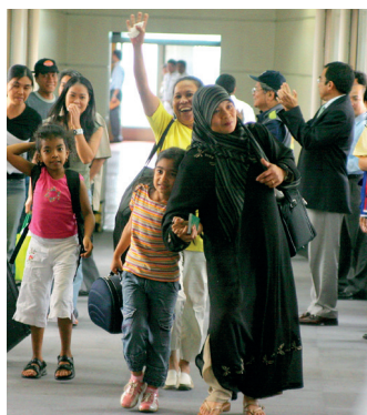
Overseas foreign workers, previously stranded in Lebanon, wave upon arrival in the Philippines.

Providing accessible and quality health services that include prevention, health information, and access to primary health care, to migrant workers and their families benefits migrant populations and serves as an important public health measure that simultaneously protects the people of the communities of origin, transit, and destination. If migrant workers are unable to access public health systems (for example, due to their documentation status, fear of arrest, financial costs, or lack of time) they may be forced to remain untreated, potentially undermining public health responses.