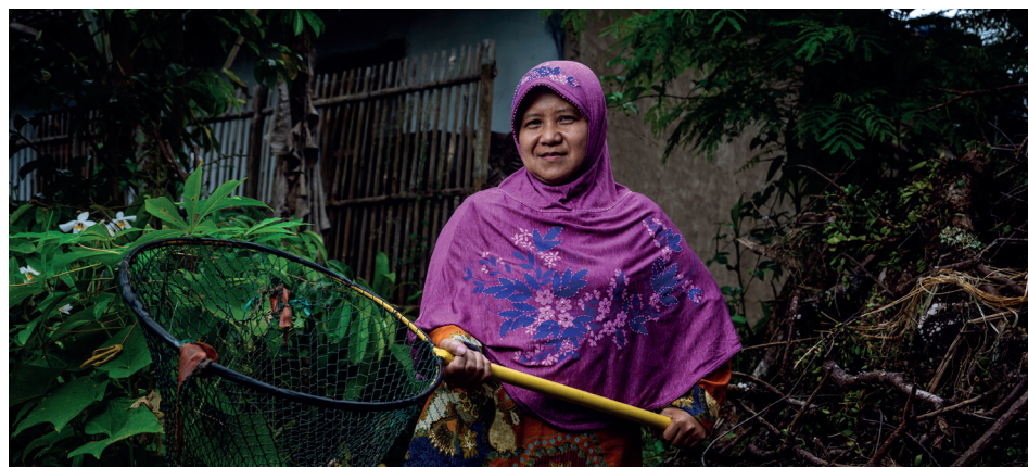
IOM has assisted the return of more than 8,500 Indonesian victims of trafficking and provided many of them with the training and resources to launch their own businesses.

When properly managed, labour migration can yield development opportunities and greater health outcomes for migrant workers and their families as well as for origin, transit and host communities.