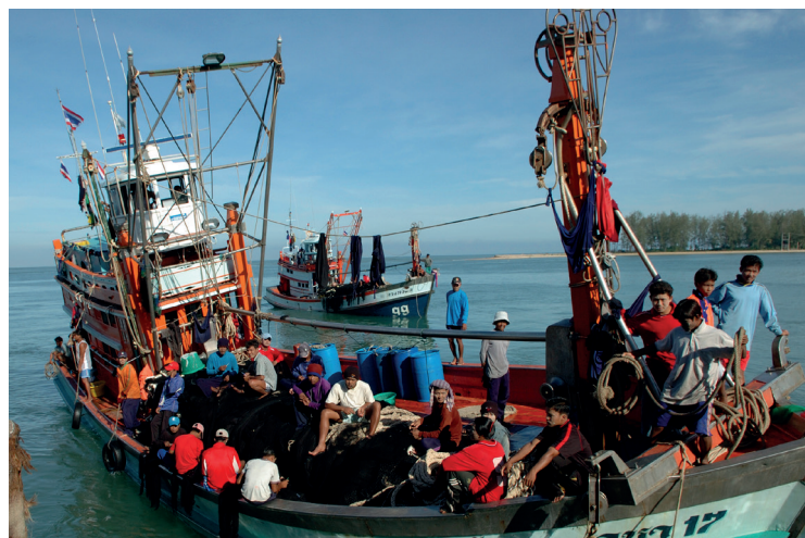
Burmese migrants work in fishing boats coastal communities in Phang Nga, Southern Thailand.

The majority of migrants are young, fit and healthy when they embark on their journeys. However, difficult conditions throughout the migration cycle may negatively impact their health. Migrant workers, particularly those in irregular situations, are exposed to hazardous travel, exploitation, poor working and living conditions with insufficient to absent labour protection and occupational safety and significantly higher risk of occupational injury and mortality. Migrant workers also have disproportionately less access to health services due to, for example, legal, administrative, linguistic and cultural barriers, discrimination, fear of deportation or lack of knowledge of their rights. Social exclusion and the distance they must endure away from their family and support systems may further increase the toll on their health and wellbeing.