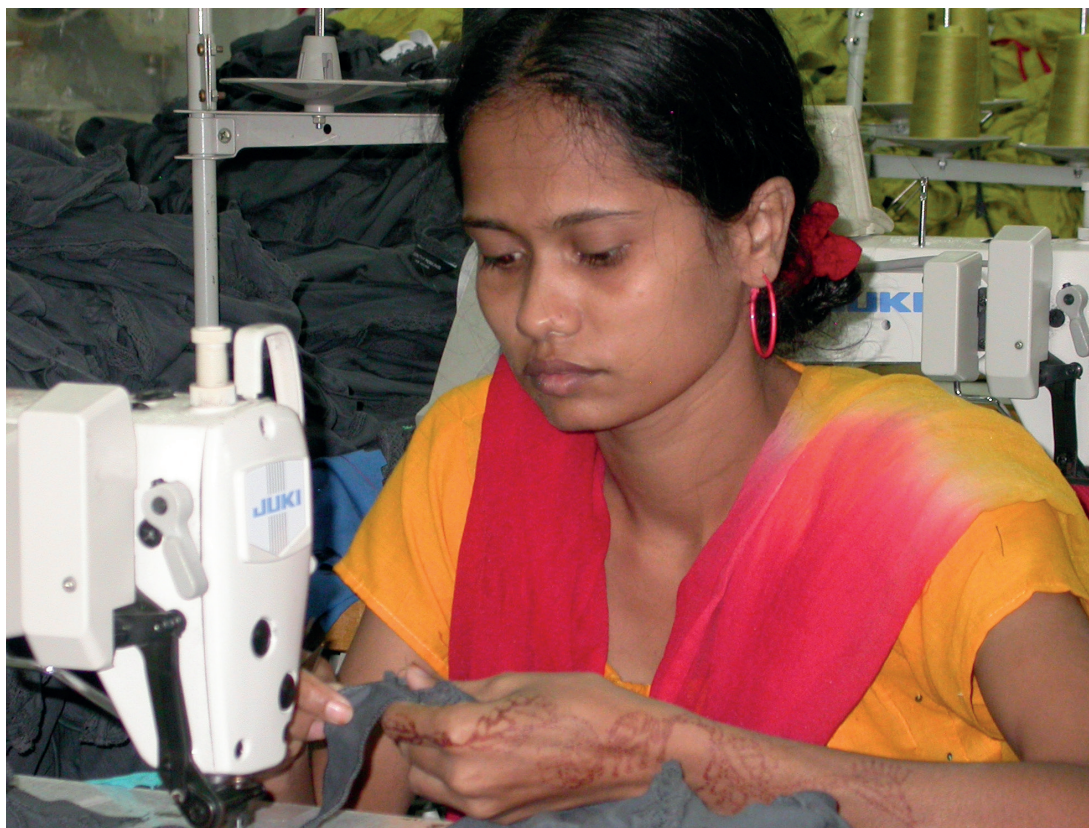
Bangladesh textile workers in Mauritius.