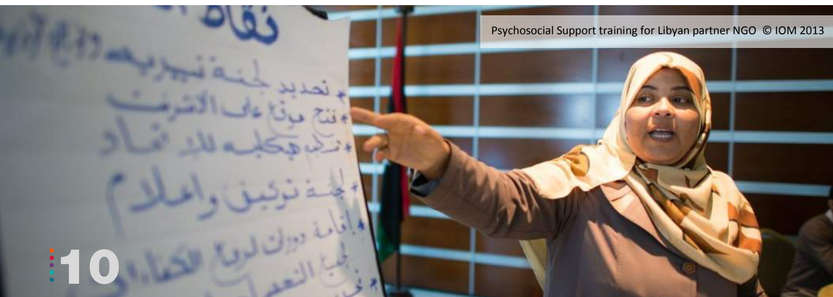
Psychosocial Support training for Libyan partner NGO

Due to alarming reports received from IOM's implementing partners regarding the deplorable conditions in detention centres where migrants, especially women and unaccompanied minors, are subject to mul-