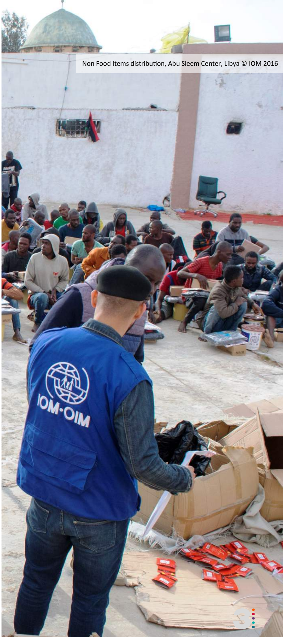
Non Food Items distribution, Abu Sleem Center, Libya

Over a 16-month period, IOM is requesting a total of USD 61,800,000 to implement the following activities in Libya, between August 2016 and December 2017.