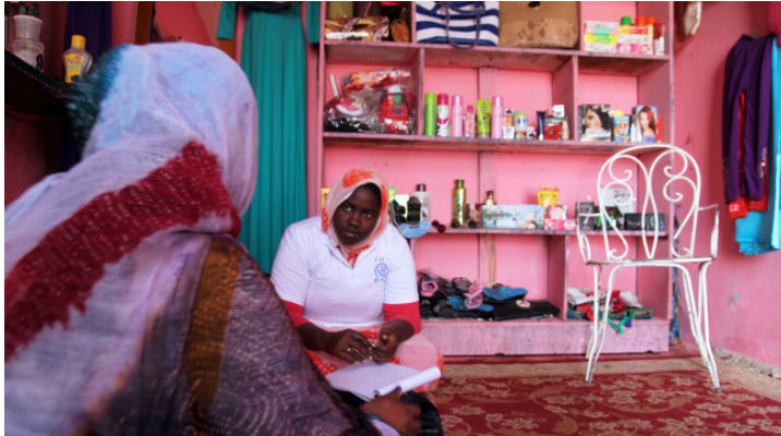
Monitoring visit to a victim in her business, financed by IOM.