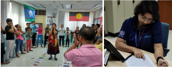
IOM cultural orientation training conducted physically and online

https://www.iom.int/migrant-training-and-integration