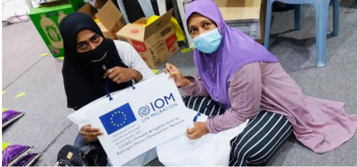
IOM Malaysia provides health and hygiene items to vulnerable migrants and refugees

https://www.iom.int/migrant-protection-and-assistance