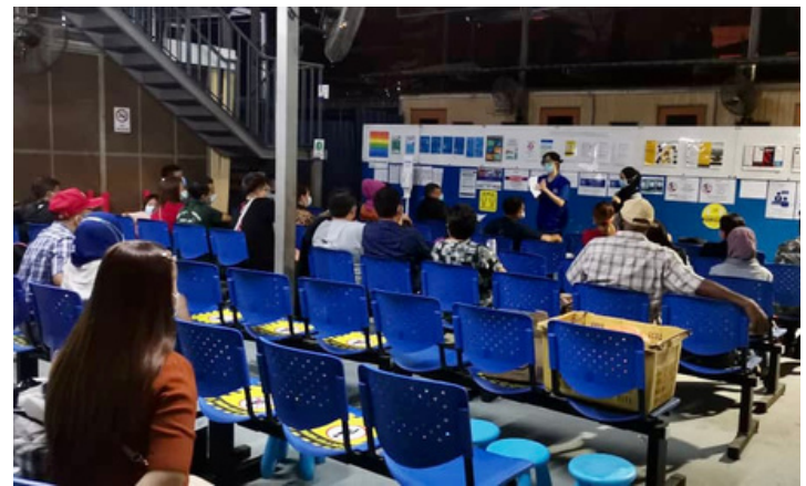
IOM staff inform beneficiaries on COVID-19 Standard Operating Procedures (SOPs) and use of Personal Protective Equipment (PPE)

https://www.iom.int/resettlement-assistance