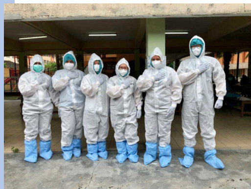
IOM staff support the Government of Malaysia to provide assistance during the COVID-19 pandemic

At the height of the pandemic, IOM assisted the Government in distributing hygiene and health kits to beneficiaries and engaged with media to address discrimination and xenophobia towards migrants and refugees. IOM is committed to the principle of safe, regular and dignified migration for the benefit of all, and continues to work with the Government of Malaysia to ensure no one is left behind.