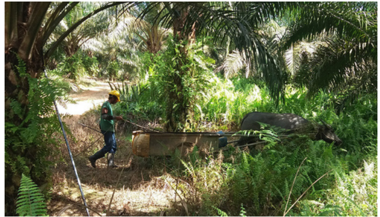
Around 80 per cent of Malaysia palm oil workers are migrants, mainly from Indonesia, Nepal and Bangladesh

https://www.iom.int/labour-mobility-and-human-development