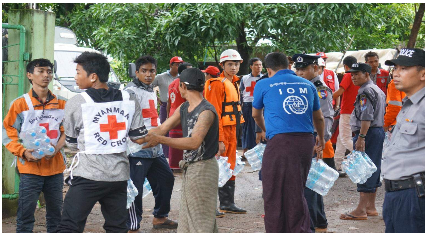
IOM staff distributing drinking water and noodle to the flood victims in Du Yin Seik Center, Mon State .