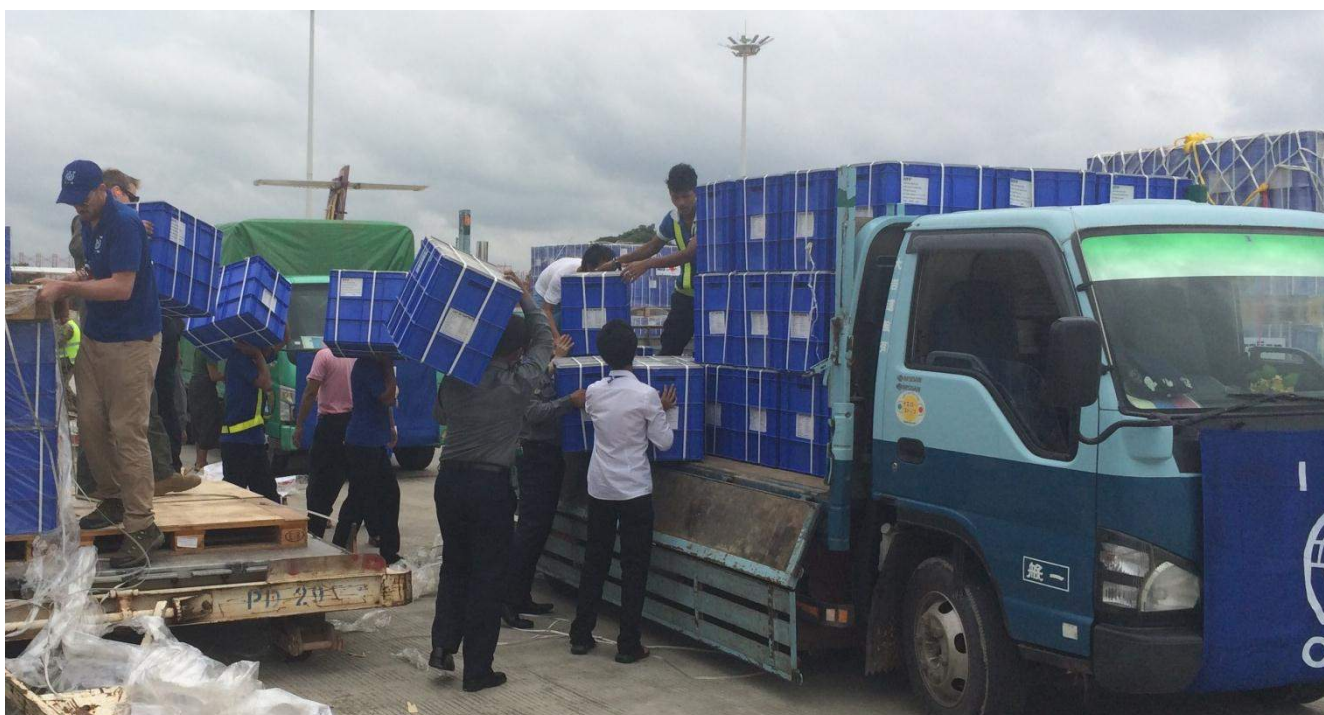
IOM staff receiving family kits at Yangon International Airport.