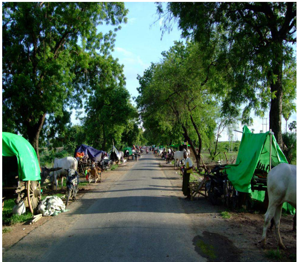
Displaced persons along the road, Salingyi Township, Sagaing.

In accordance with IOM's institutional commitment to the principles of accountability to affected populations, all IOM's programming facilitates the engagement of cyclone/flash flood-affected men, women, boys and girls, such that they are part of decision-making processes and regularly receive information on available services. This community engagement also aims to instil a sense of involvement in and ownership of response activities, thereby building resilience and promoting a sense of normalcy throughout the response.