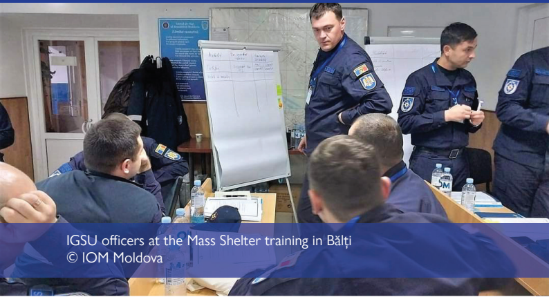
IGSU officers at the Mass Shelter training in Bălți

IOM Moldova continues to offer support to National Authorities on capacity building in preparation for large-scale emergency response. Sessions on Mass Shelter Capabilities were organized by IOM Moldova in Balti and Cahul with the participation of the Inspectorate General of Emergency Situations (IGSU) to strengthen its technical and organizational skills. These initiatives are funded by the United States Bureau of Population, Refugees and Migration.