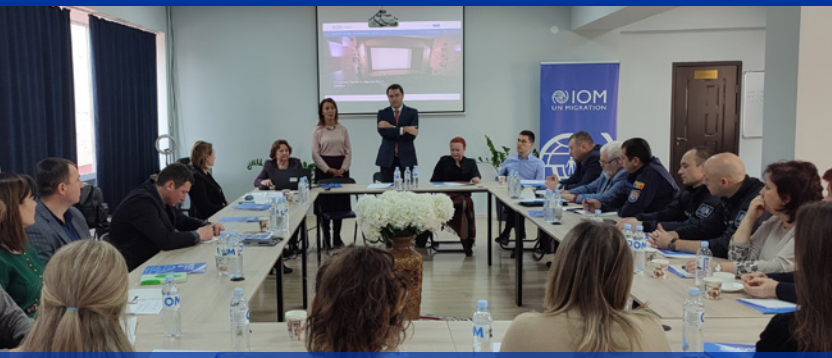
Launching the Migration Governance Indicators in Cahul municipality

In terms of migration flows, the situation remained stable in the country throughout the month of January, with steady numbers of daily crossings both ways at the border crossing points with Ukraine. People coming from Ukraine who needed transportation continued to use the available transport options into Europe and beyond, and the assistance options available in Moldova.