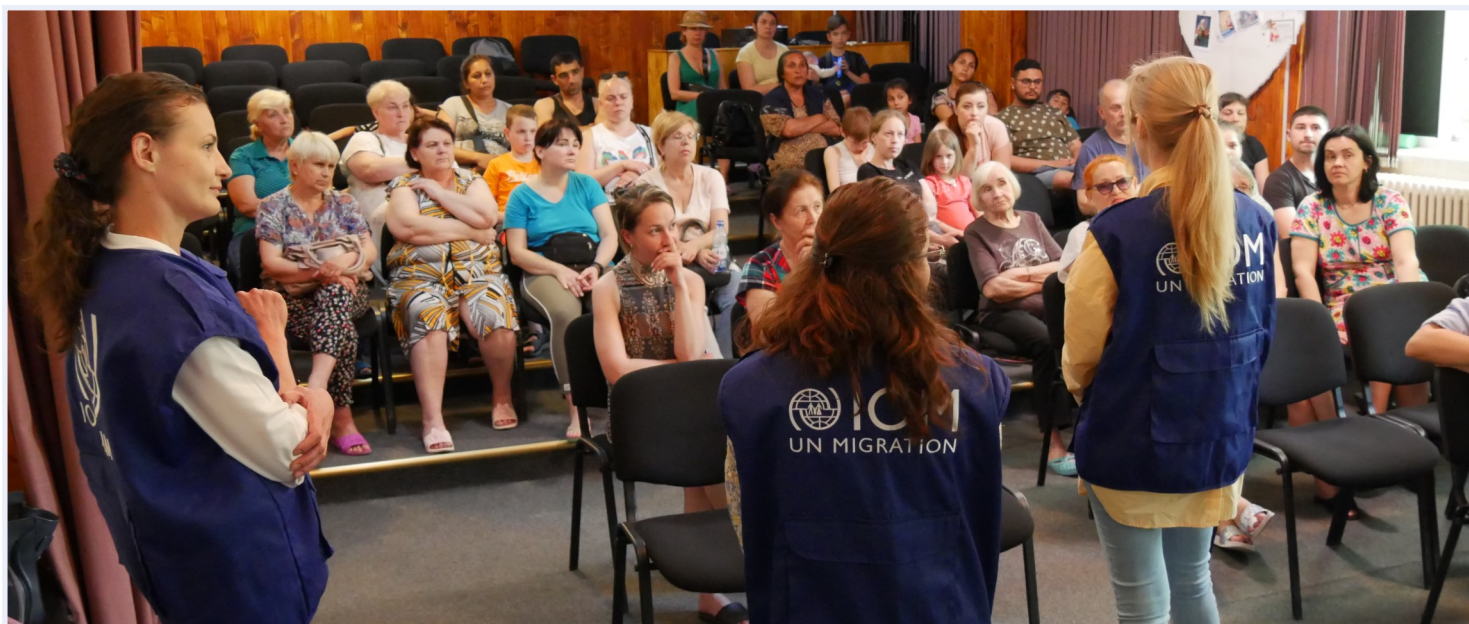
IOM 2022