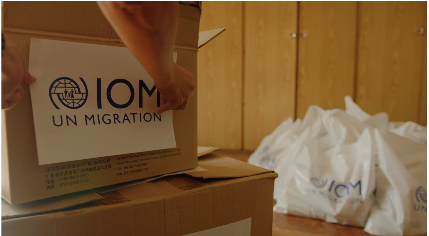
Boxes and bags with humanitarian assistance for refugees and migrants consisting of food and non-food items

During the reporting period, IOM provided shelter support, food and hygiene kits for up to 20 vulnerable migrants on average daily.