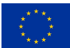
Funded by the European Union