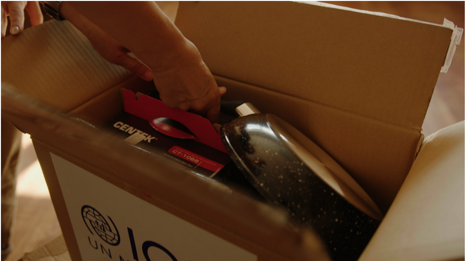
Household items are prepared to be delivered to beneficiaries