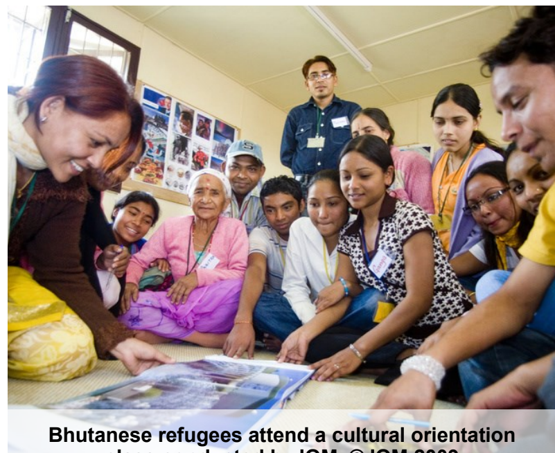
class conducted by IOM.