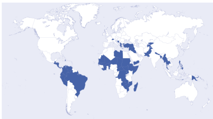
GLOBAL OVERVIEW OF IOM'S STABILIZATION PROGRAMMING IN 2020

Displacement and migration crises, whether human induced, environmental or a combination of the two, can have a diverse, complex and devastating impact on people’s lives. This includes physical, visible impacts as well as less visible effects such as inter- or intra communal tensions over scarce resources, marginalization of different social ethnic or religious groups, insecurity, exploitation, and criminal or rent-seeking power structures. Some of these factors may have led to displacement or been a driver of migration in the first place. All of these impacts can weaken the social, physical, cultural, economic, judicial and security structures and systems required for societies to function. Leaving the different factors driving instability unaddressed can result in the re-emergence of violence, humanitarian crises and displacement or prevent impacted populations from embarking on pathways towards recovery and ‘Durable Solutions’ to displacement. Empowering communities, through participation and empowerment can play a catalytic role both in improving stability and harnessing the agency of individuals to drive positive change.