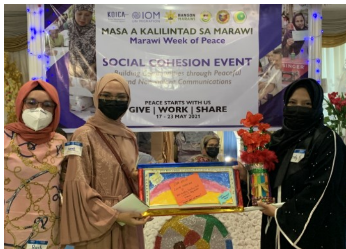
COMMUNITY YOUTH LEADERS AND REPRESENTATIVES THEIR TALENTS DURING THE MARAWI YOUTH CULTURAL EVENTS

At the center of IOM's CSA is the community based planning and recovery methodology (CBP), where local communities, vulnerable and marginalized populations (IDPs, refugees, ex-combatants, women, youth), local authorities, and members of civil society, are involved in all phases of project development, implementation and monitoring. This process can help produce empowered communities, strengthened support networks, improved social cohesion, improved capacity of community members and structures and local ownership leading to more sustainable recovery outcomes. IOM Community Stabilization programmes operate at the local level in order to build stability from the ground up and take advantage of IOM's presence and relationships in the field.