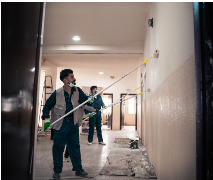
A GROUP OF YOUTH VOLUNTEERS FROM DIVERSE BACKGROUNDS REHABILITATE A SCHOOL TOGETHER TO PROMOTE SOCIAL COHESION IN DUHOK GOVERNORATE, IRAQ