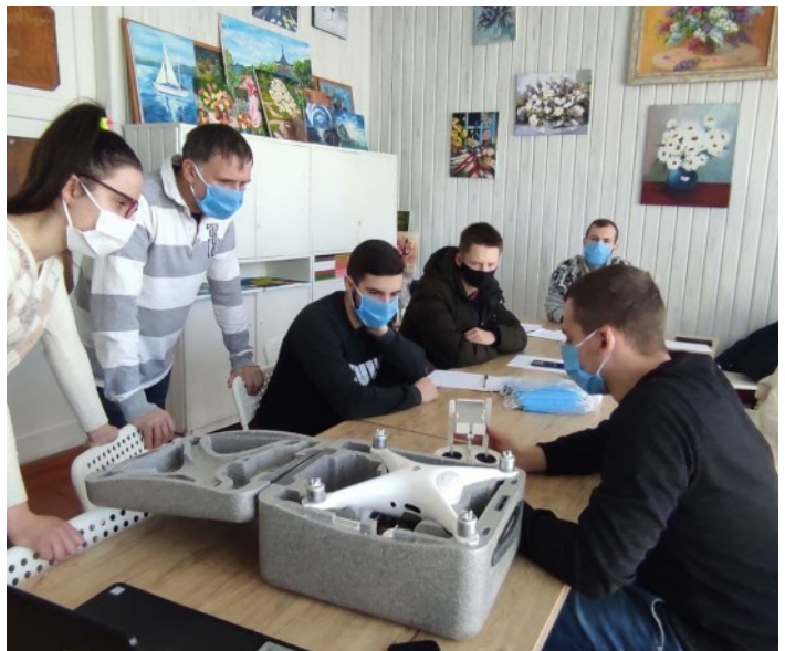
A SOCIAL COHESION AND RESILIENCE PROJECT IN UKRAINE FOCUSED ON CONNECTING YOUTH ACROSS THEIR COMMUNITY WITH LOCAL STAKEHOLDERS.