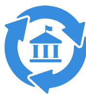
Identified government approaches

These categories encompass a variety of situations; from migrants' needs to access clear guidelines and instructions on changes to immigration and consular procedures, to technical gaps faced by governments implementing visa extensions, amongst others.