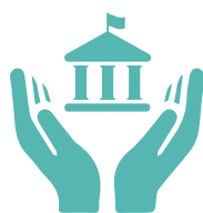
Identified government needs