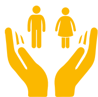
Identified migrant needs

The typology being used for this exercise is based along three broad categories: