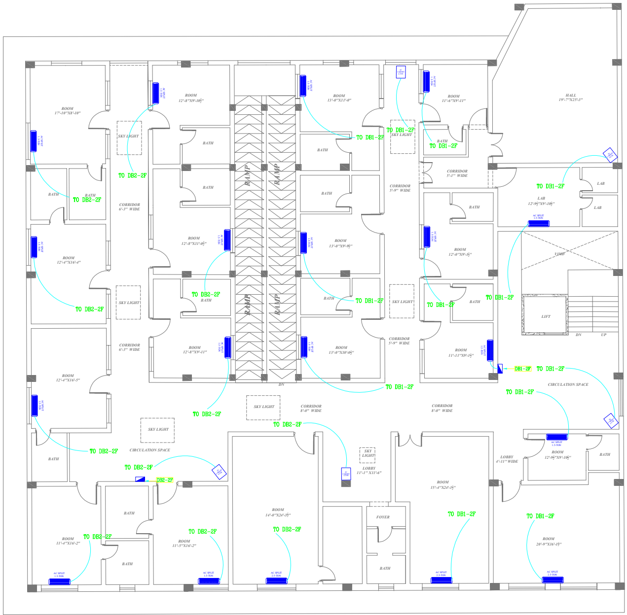
DWG. TITLE: SECOND FLOOR PLAN AS BUILT FLOOR PLAN