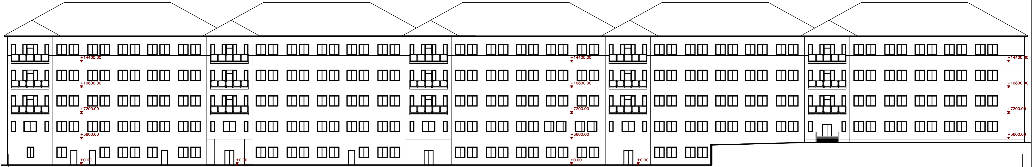
Facade 16 - 1