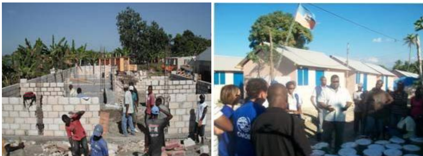
Construction of a community center is underway (left); the handover of the completed T-shelters in presence of the Mayor of Leogane at Camp Rico, an IDP camp where IOM built a total of 27 T-shelter units after an agreement was reached with the landowner (right)

IOM T-shelter and community centre operations in Leogane are supported by Community Chest of Korea.