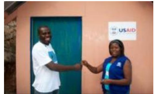
T-shelters are being built for former camp residents in Pétiion-Ville. Photos show a beneficiary's plot before and after the T-shelter construction.