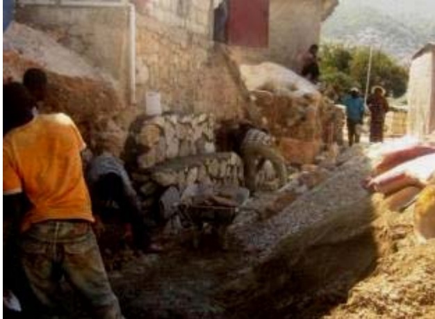
Footpath rehabilitation, Carrefour Feuilles, Port-au-Prince

IOM Shelter Program is supporting risk mitigation and communal infrastructure rehabilitation activities through construction of retaining walls, drainage canals and footpaths. The projects target areas known as Mangeoire, Croix-des-Prez, Carrefour Feuilles and Morn Lazare, all poor and highly-populated urban communities on steep slopes, severely-affected by the January 2010 earthquake (See page 2 for the summary achievements). The photographs below illustrate some of the ongoing works. These risk mitigation and infrastructure rehabilitation activities are supported by CIDA and USAID.