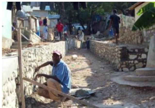
Drainage and footpath rehabilitation, Mangeoire, Port-au-Prince