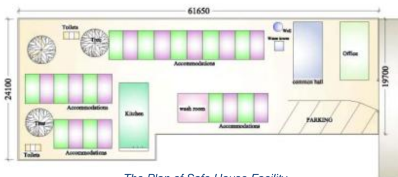
The Plan of Safe House Facility

Some GBV victims receive threats, including death threats, from the perpetrators and their associates. The Safe House initiative can provide physical safety for such victims. The Safe House activity is supported by Sida.