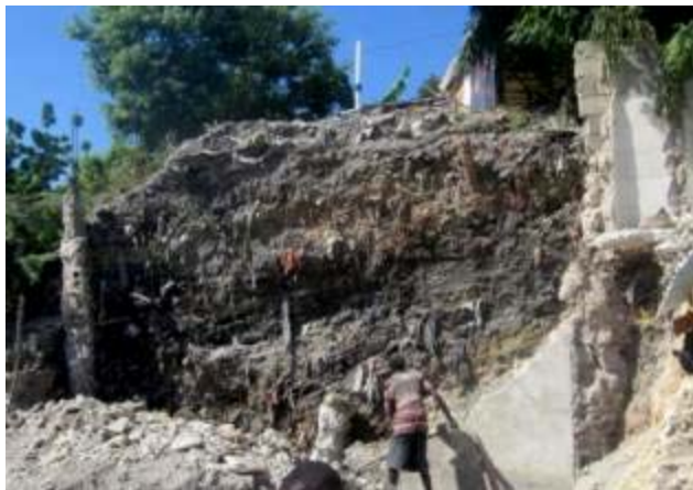
Retaining wall construction, Carrefour Feuilles, Port-au-Prince