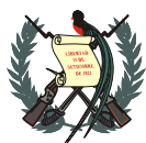
Ministry of Foreign Affairs Guatemala