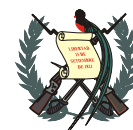
Ministry of Labor and Social Welfare Guatemala