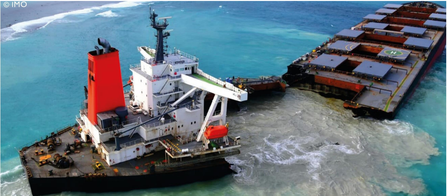
IOM PROVIDES TECHNICAL EXPERTISE AND OPERATIONAL SUPPORT TO THE GOVERNMENT OF MAURITIUS IN CONTAINING THE OIL SPILL