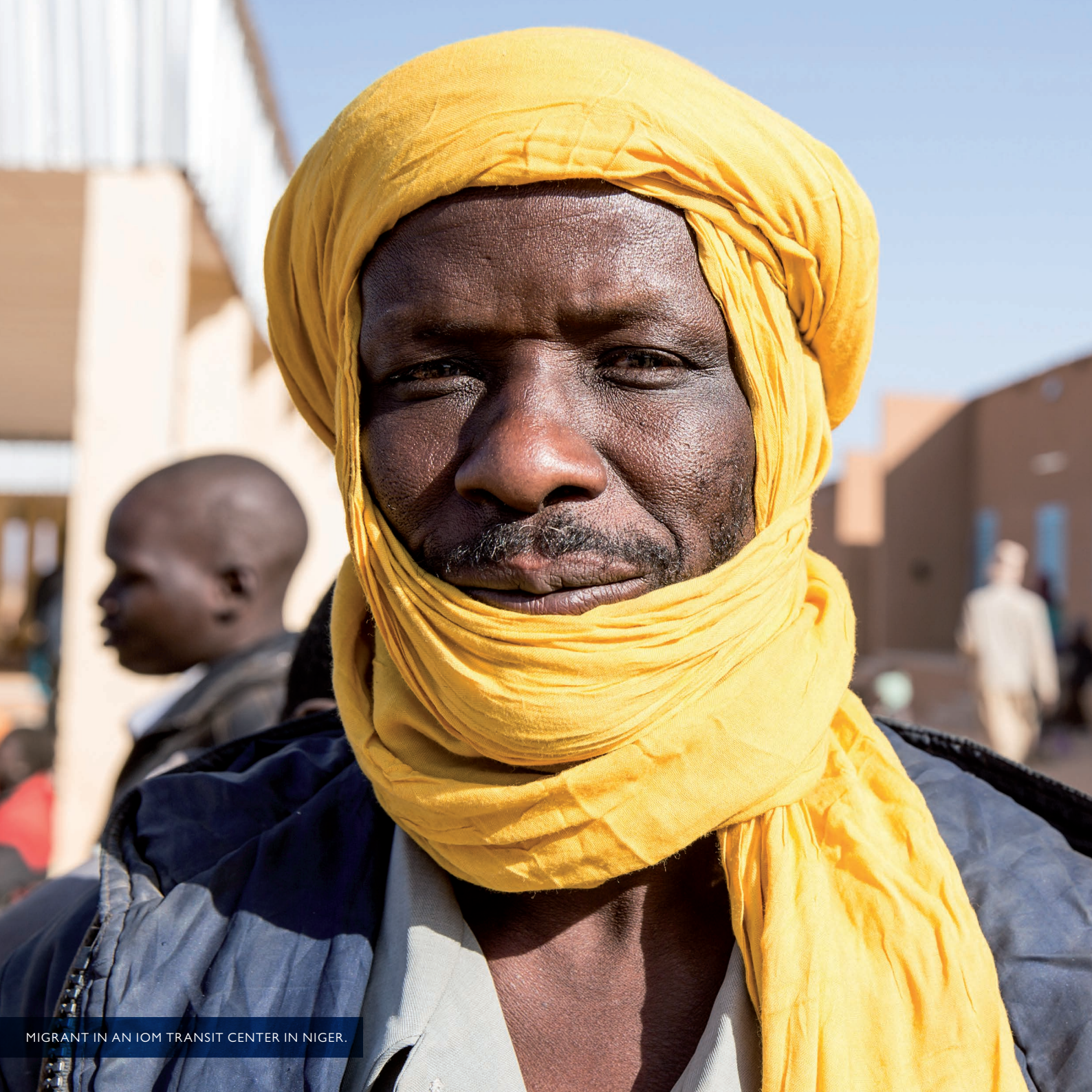
MIGRANT IN AN IOM TRANSIT CENTER IN NIGER.