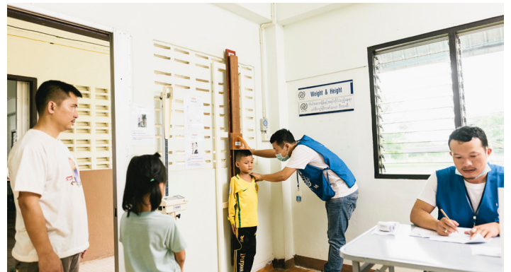
Nurses measure height and weight at an IOM clinic in Thailand.