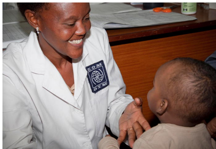
An IOM nurse in Nairobi provides vaccinations against measles.

Anonymized information can be analyzed to support the development of evidence-based policy and practices, to raise awareness of migrant health priorities and to contribute to the evidence base on refugee and migrant health.