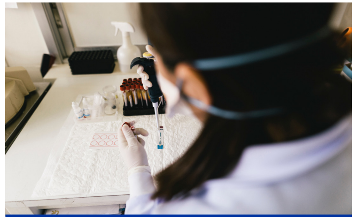
Preparing blood samples for testing in an IOM laboratory.