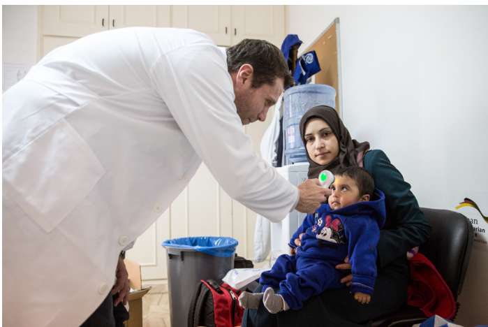
An IOM doctor takes the temperature of a Canada-bound Syrian refugee during a pre-embarkation check.