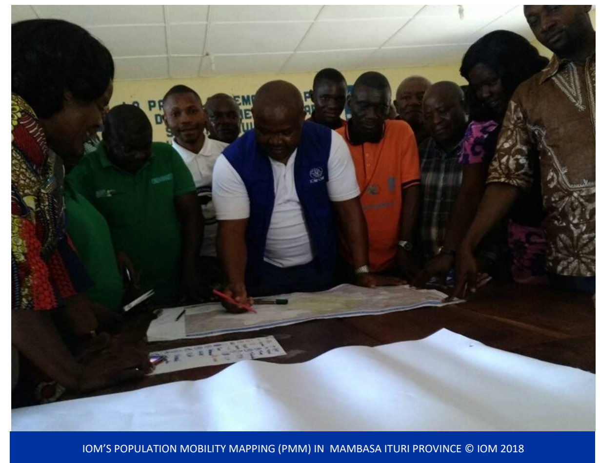
IOM'S POPULATION MOBILITY MAPPING (PMM) IN MAMBASA ITURI PROVINCE

The exercise was concluded with a summary of the findings and feedback sought from participants. The exercise was followed by collection of GPS coordinates for points of interest and the development of an accurate map summarising the results.