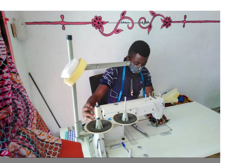
Returnee producing face masks to keep his business up and running and contribute to keeping his community safe during the COVID-19 crisis.

To mitigate the adverse impact of the pandemic on remittances, the Bank of Ghana has introduced certain policy measures, including reducing the administrative costs of mobile money transactions to encourage increased transfers to recipient families.