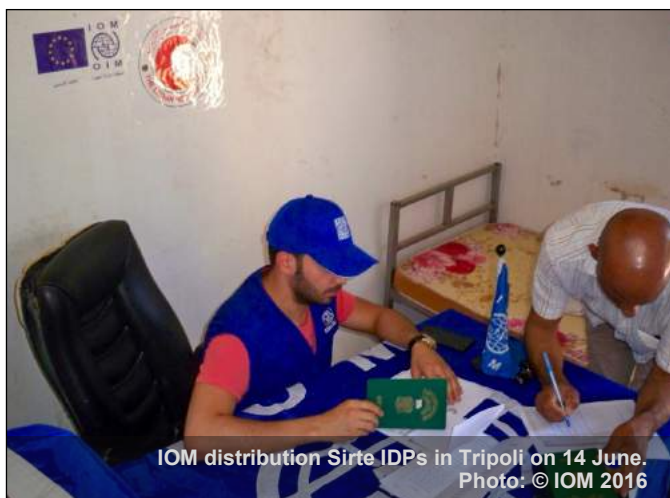
IOM distribution Sirte IDPs in Tripoli on 14 June.

Furthermore, IOM Libya has received a request to provide healthcare services to migrants rescued at sea. During June, more than 150 medical screening sessions were conducted for the migrants in detention centres and at disembarkation points. IOM Libya is continuing to provide healthcare services at 4 detention centres (Az Zawiyah's Abu Essa, Shuhadaa Al-Nasir, Al-Khums and Shahat).