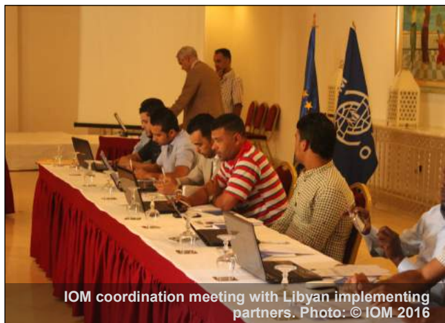
IOM coordination meeting with Libyan implementing partners.

On 27 – 28 June, IOM held its latest monthly coordination meeting with several of its Libyan implementing partners. The meeting was attended by 9 NGOs from different parts of the country representing the South, the East and the West, to discuss activities and achievements, as well as challenges.