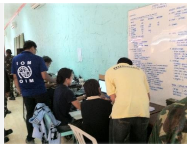
NDRRMC meeting with government and humanitarian partners