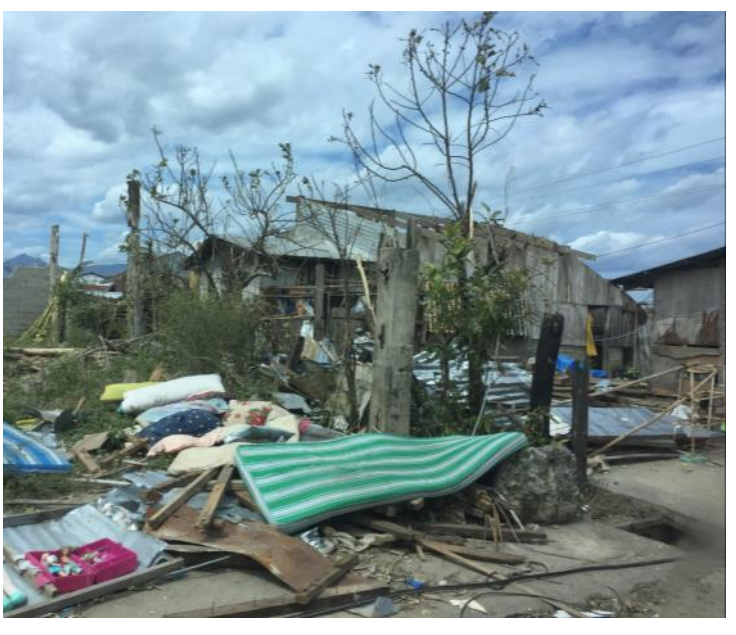
Damaged houses in Casiguran, Aurora Province