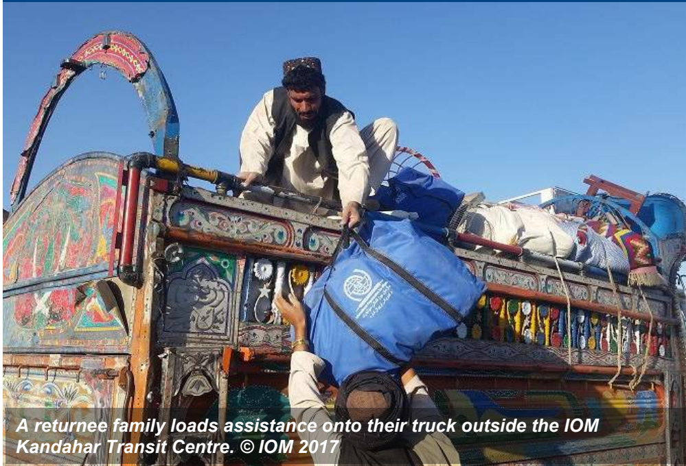
A returnee family loads assistance onto their truck outside the IOM Kandahar Transit Centre.