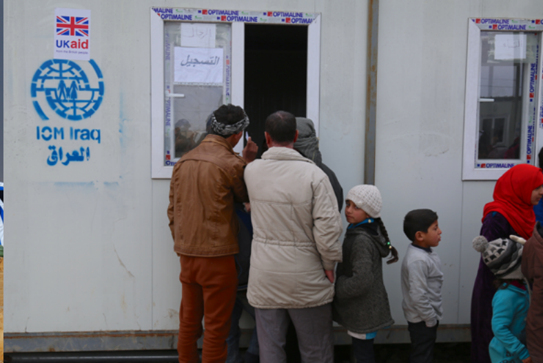
Above: IOM's health clinic in Qayara Airstrip emergency site provides more than 19,000 primary health consultations per month to displaced Iraqis. The clinic is funded by the UK Department for International Development (DFID).