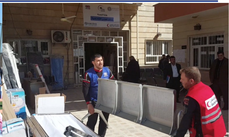
Above: As part of the Sanad Campaign, IOM Iraq and Qatar Red Crescent delivered a second round of medical equipment and supplies as well as furniture and computers to 10 primary health care centers (PHCC) in east Mosul. The aim of the campaign is to restore the full capabilities of the 10 PHCCs so that they can provide better services to the local population. The items are funded by DFID.