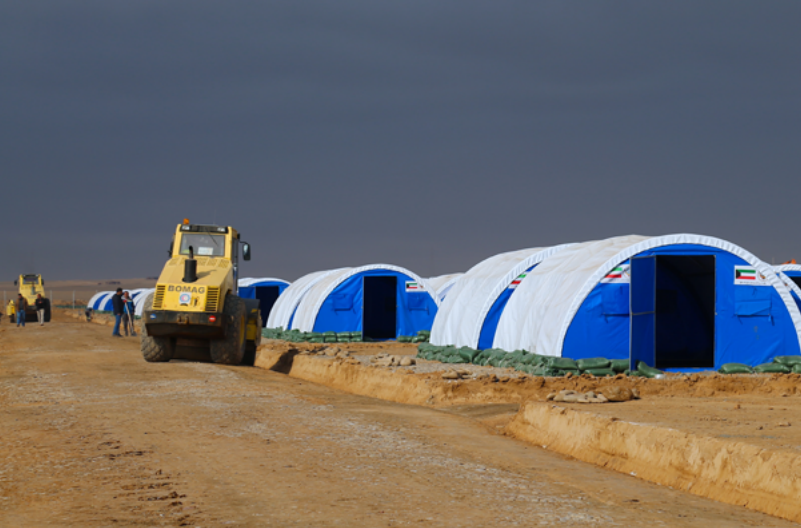
Above: With support from Kuwait, IOM is expanding the Qayara Airstrip emergency site by adding 2,000 tents. Tent set up has been completed; humanitarian partners are installing WASH facilities.