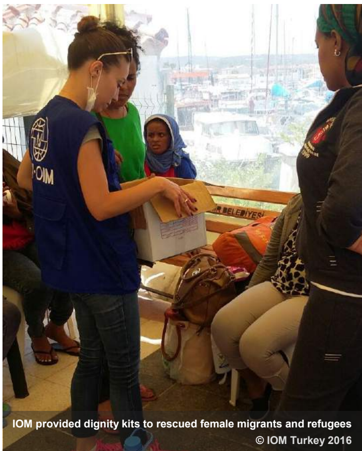
IOM provided dignity kits to rescued female migrants and refugees

IOM continues to provide support to the TCG through the distribution of food, water and non-food items (NFIs) to rescued migrants and refugees. During the reporting period, IOM assisted the TCG in Dikili (a district of Izmir province where migrants and refugees cross to the island of Lesbos in Greece) by providing 100 rescued migrants and refugees with food, water and NFIs, including blankets, clothing and shoes. The majority of those rescued at sea in Dikili came from Syria and Eritrea. Furthermore, in Çeşme, IOM supported the TCG through the provision of food, water and NFIs to 117 migrants and refugees who were rescued at sea during the reporting period.