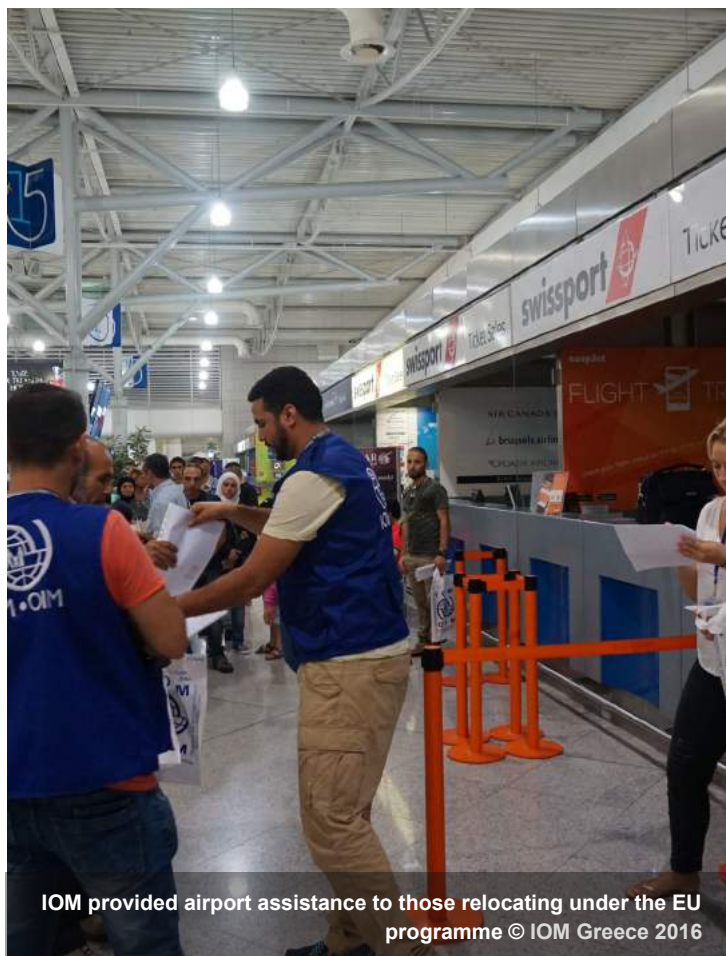
IOM provided airport assistance to those relocating under the EU programme

To date, IOM has assisted 1,427 asylum seekers as part of the EU relocation programme. All beneficiaries are provided with pre-departure medical checks as well as extensive cultural orientation sessions that provide practical information on their respective country of destination. IOM also helps the refugees to set realistic goals and develop skills that can help them to succeed in their new environment. When necessary, IOM also provides escort service to cases involving unaccompanied children, people with medical needs, and in countries of transit.