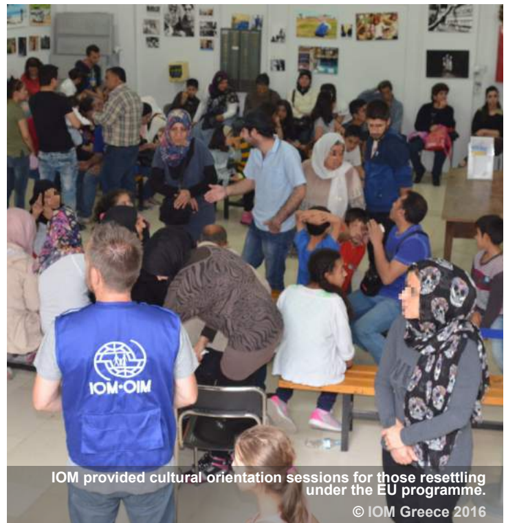
IOM provided cultural orientation sessions for those resettling under the EU programme.

On 8 June, the Asylum Service under the Hellenic Ministry of Interior and Administrative Reconstruction launched a large scale operation to pre-register applications seeking international protection. This procedure will allow third country nationals in mainland Greece to seek asylum in the country, receive family reunification services, or be relocated to another EU member state. IOM is present during the pre-registration process to ensure that the population is also informed of their rights and options for assisted voluntary return and reintegration if it is necessary.