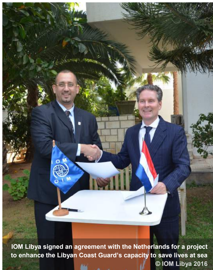
IOM Libya signed an agreement with the Netherlands for a project to enhance the Libyan Coast Guard's capacity to save lives at sea

will also provide assisted voluntary return to stranded migrants in Libya to help them return to their home countries. The most vulnerable migrants will also receive reintegration assistance once they arrive in their home countries. The project's primary beneficiaries will be migrants, with a particular focus on the stranded and most vulnerable. Other beneficiaries will include civil society organizations, local authorities, the Coast Guard and Libya's Directorate for Combatting Illegal Migration.