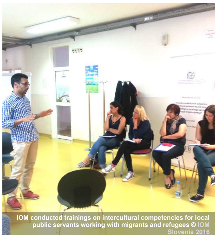
IOM conducted trainings on intercultural competencies for local public servants working with migrants and refugees

During the reporting period, IOM conducted two trainings on intercultural competencies for a total of 65 representatives from local governmental and non-governmental organizations in Maribor (from 2-3 June) and Ljubljana (from 9-10 June). The trainings helped to increase the awareness among public servants on the concepts of migrations and on the dynamics of integration, as well as to improve the intercultural competencies in order to increase the quality of service provided to migrants and refugees.