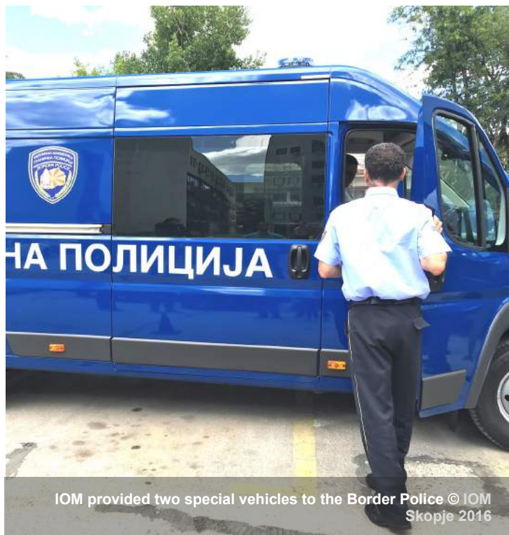
IOM provided two special vehicles to the Border Police

In Vizbegovo, IOM continues to provide renovation work on the Reception Centre for Asylum Seekers. More specifically, IOM is improving the water supply at the centre to meet the needs of those accommodated at the centre.