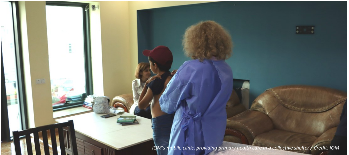
IOM's mobile clinic, providing primary health care in a collective shelter