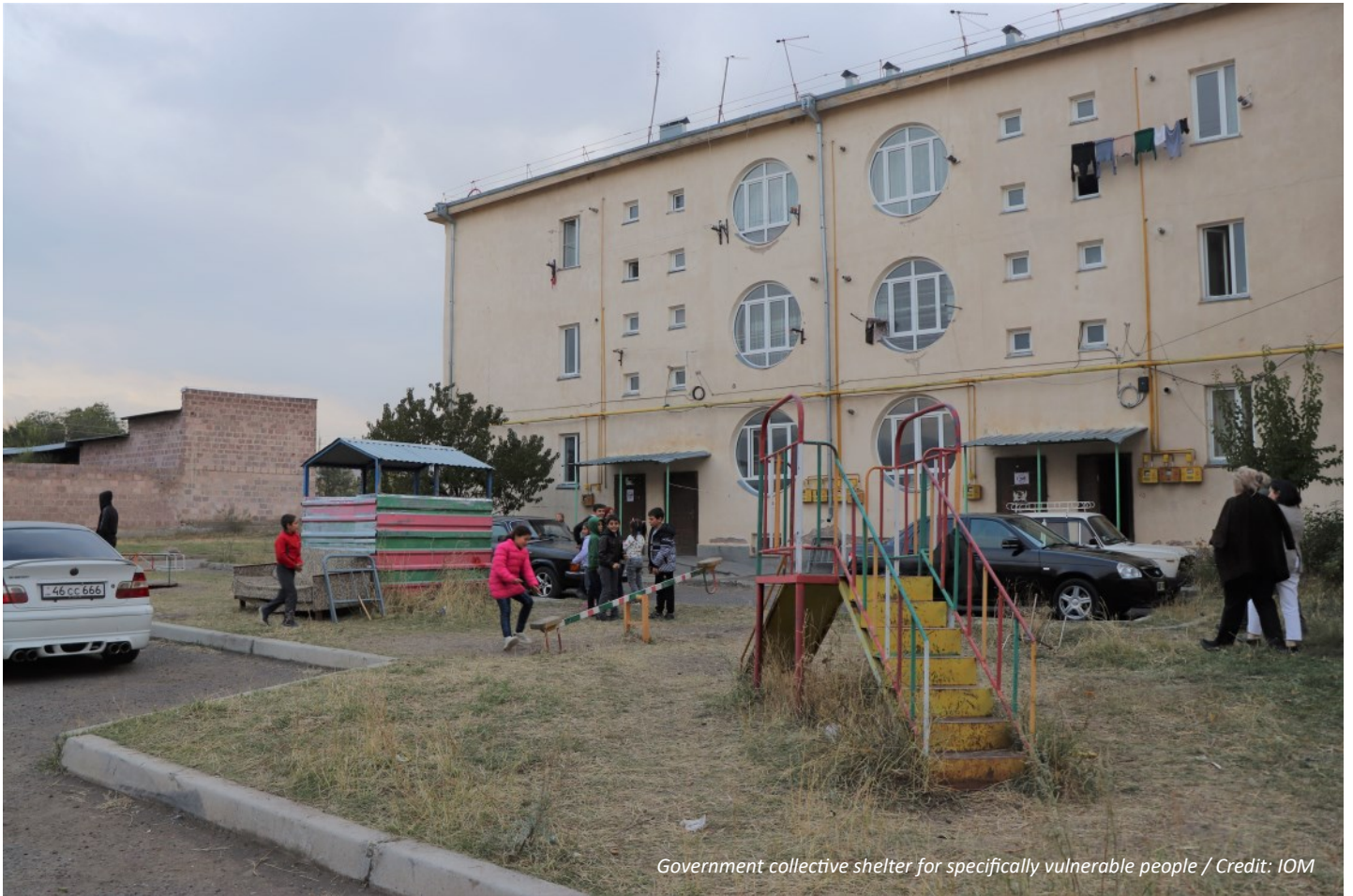
Government collective shelter for specifically vulnerable people

Approximately 40,000 people are temporarily accommodated in emergency shelters. These are buildings - old factories or hospitals - which are currently out of use, but they could accommodate a large number of people.