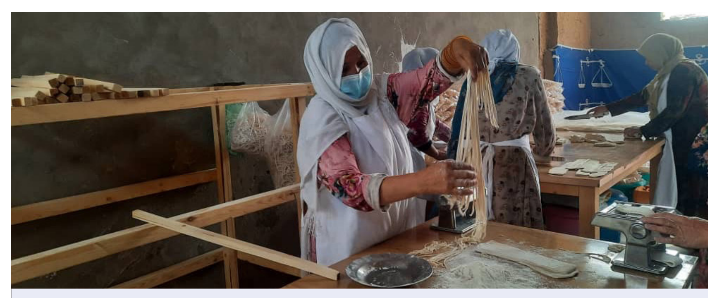
Women in Balkh producing noodles as part of a female-run processing association, 27 September