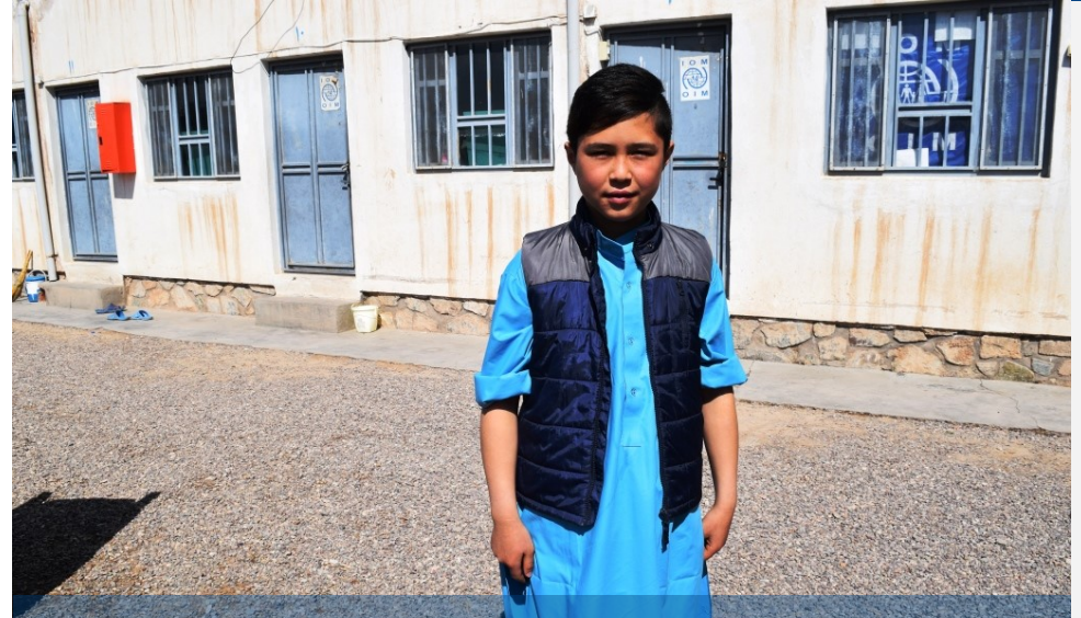
An unaccompanied migrant child in front of the IOM Transit Center in Herat