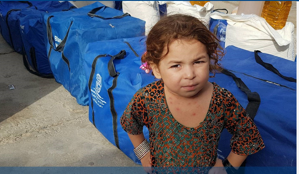
A returnee Child waiting for her family to receive assistance in KTC on 01 May 2018