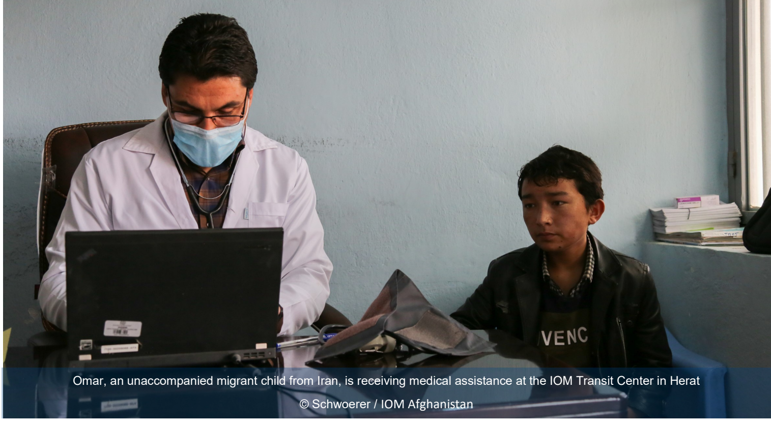
IOM Afghanistan has assisted 28,079 undocumented Afghans returning from Iran and Pakistan since 01 January 2018, thanks to the dedication of our staff and the generosity of our donors.