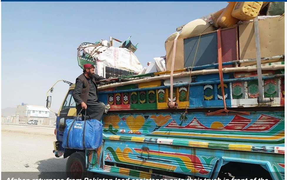
Afghan returnees from Pakistan load assistance onto their truck in front of the IOM Transit Center in Kandahar