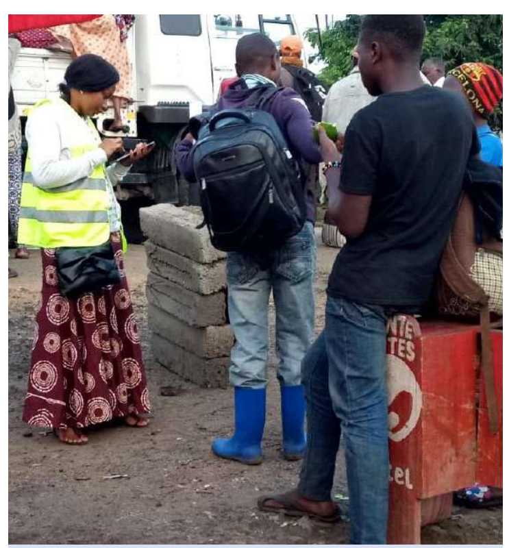
An FMP data collector in Kitoboko, Rutshura (North Kivu Province).

IOM DTM and Migration Health Division (MHD) unit continue to collect data on population flows from selected POE/POCs in North Kivu Province. Since 19 August, 15 data collectors have been positioned at POE/POCs Mubambiro, Grande Barriere, and Goma Airport in North Kivu. The information collected through this exercise is used to better understand the nature, volume, direction and drivers of migration in the area affected by Ebola and its surrounding.