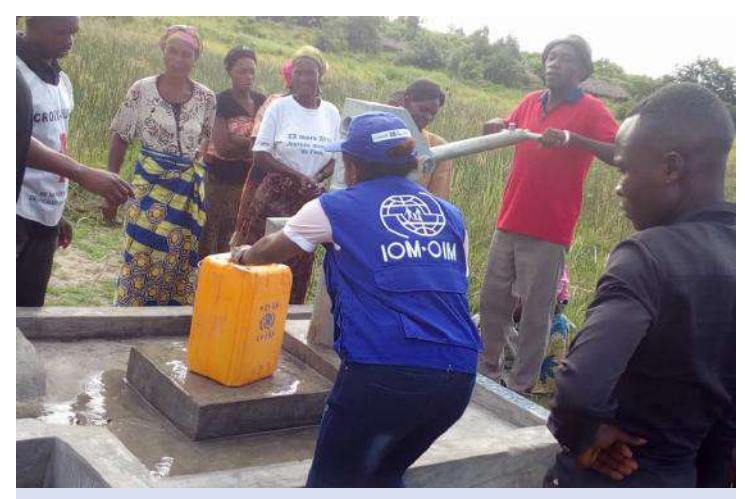
IOM's Shelter/WASH teams conducting hygiene awareness sessions at the Kaseke IDP site, Tanganyika Province.

Following cholera alerts, of which 16 cases are confirmed, in Kaseke site, Tanganyika, IOM distributed WASH materials namely 20kg powdered soap and 200kg lime to maintain hygiene of WASH facilities. In addition, IOM carried out hygiene awareness sessions focusing on improving handwashing practices. The assistance benefitted 7,883 IDPs living in Kaseke site.