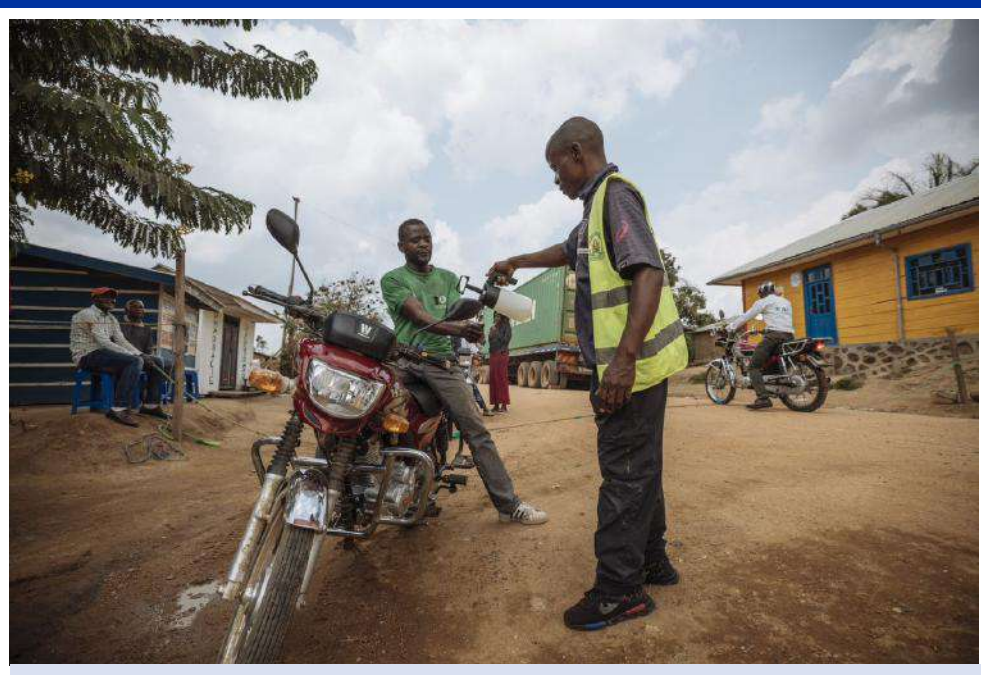
Thousands of travellers stop each day at Komanda POC to wash their hands and are screened for symptoms of Ebola before continuing their journeys, Ituri Province.

Points of Control/Points of Entry supported by IOM as part of the EVD response